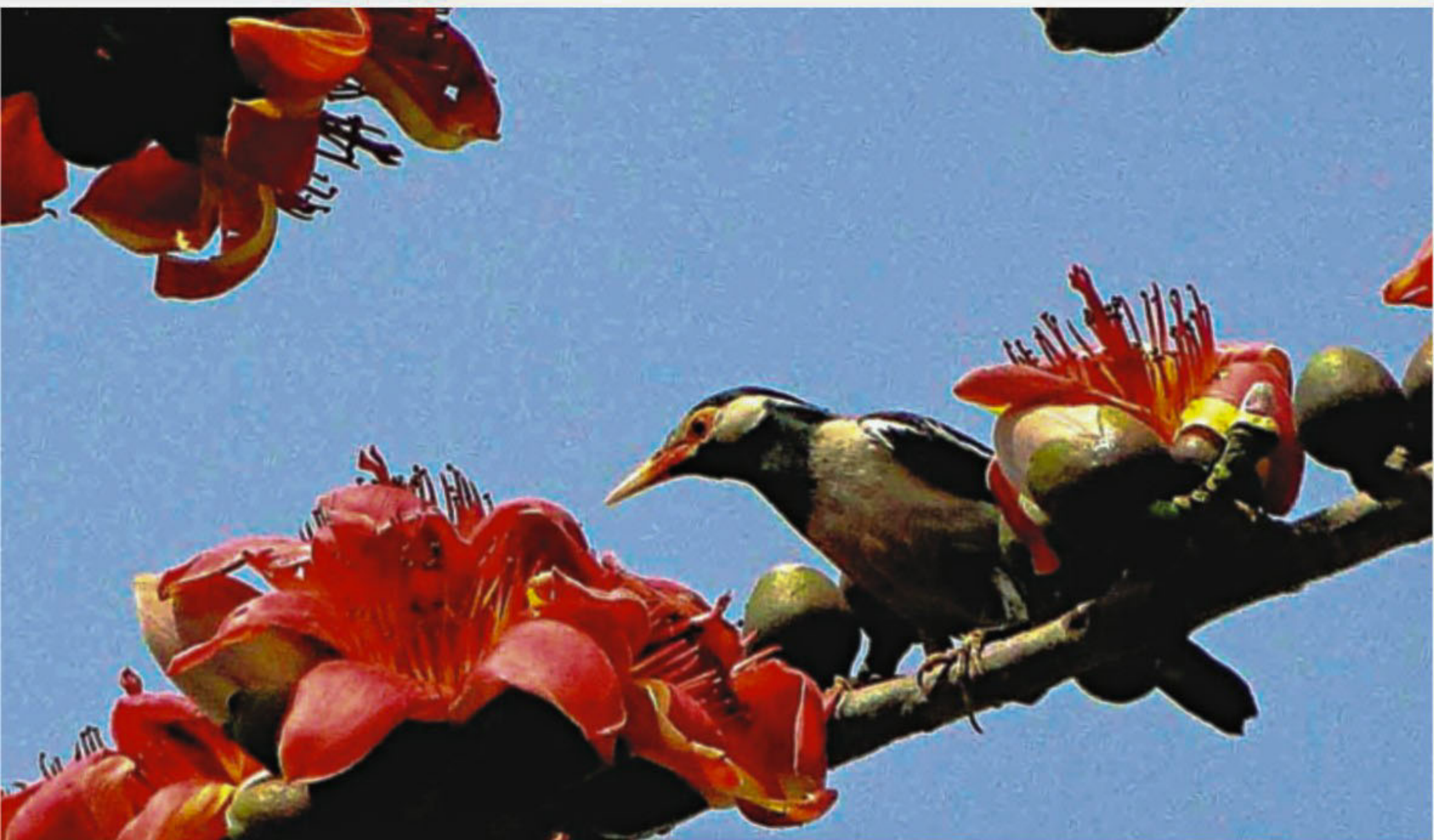
Blooming cotton silk flowers, heralding the advent of spring, offer a captivating sight. The photo was taken from Kashiadanga in Rajshahi.