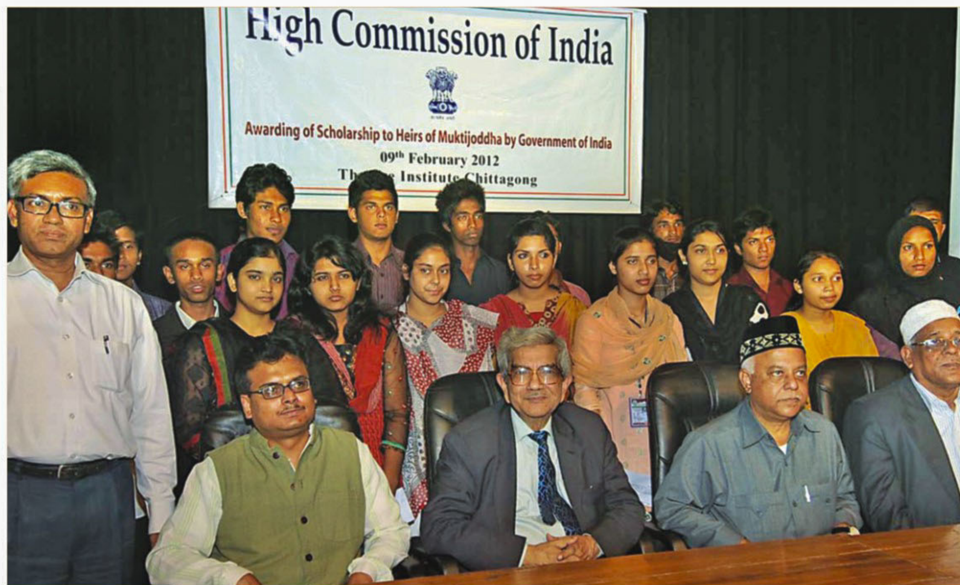
Chittagong City Corporation Mayor M Manjur Alam, second from right, with the descendants of freedom fighters who were awarded student scholarships by the Indian government at Theatre Institute of Chittagong city yesterday.

On the occasion, recitation from the holy Quran and doa mahfil will be held at her house at 17/3, Shukrabad at 4:00pm.