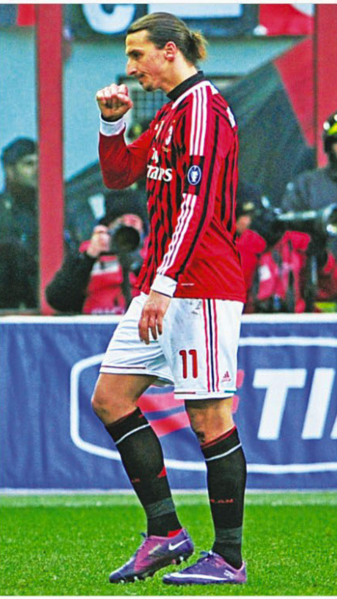
AC Milan star Zlatan Ibrahimovic leaves the pitch after receiving a red card during their Serie A clash against Napoli at San Siro on Sunday.

Euro 2012 kicks off on June 8 in Warsaw, and ends on July 1 with the final in Kiev.