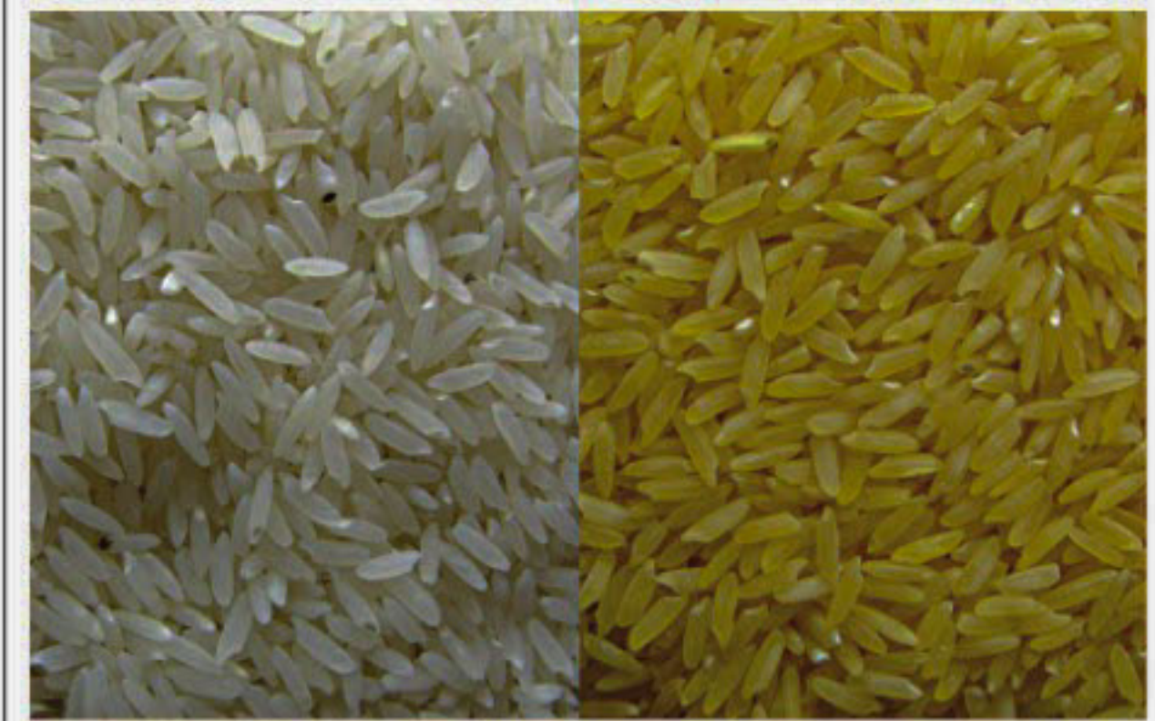
Golden Rice is seen next to regular rice. The golden one contains beta carotene, a source of vitamin-A.