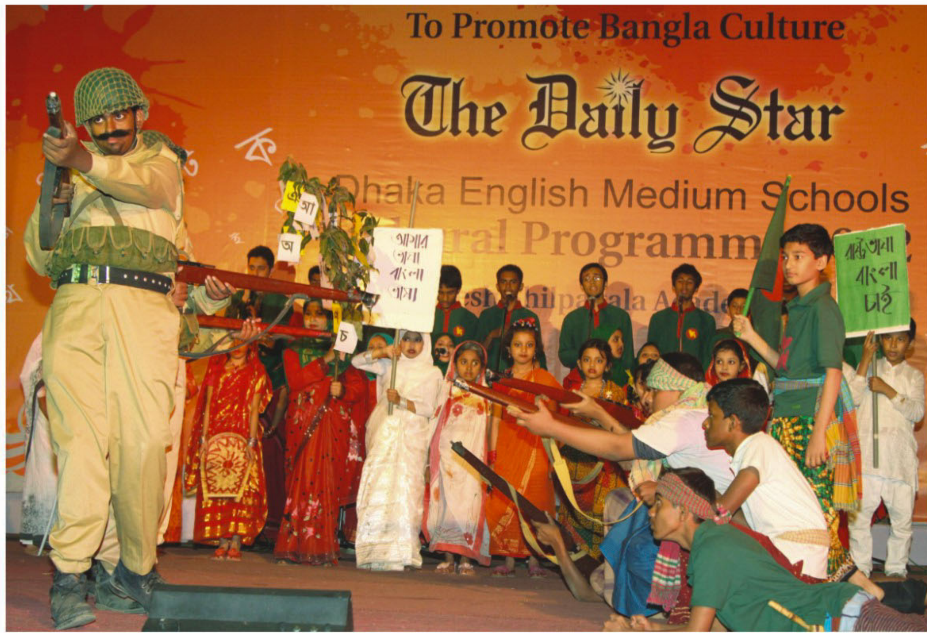
Students of Islamic International School and College perform at "The Daily Star-Dhaka English Medium School Cultural Programme" at the Shilpakala Academy yesterday. See photo feature on page 12.