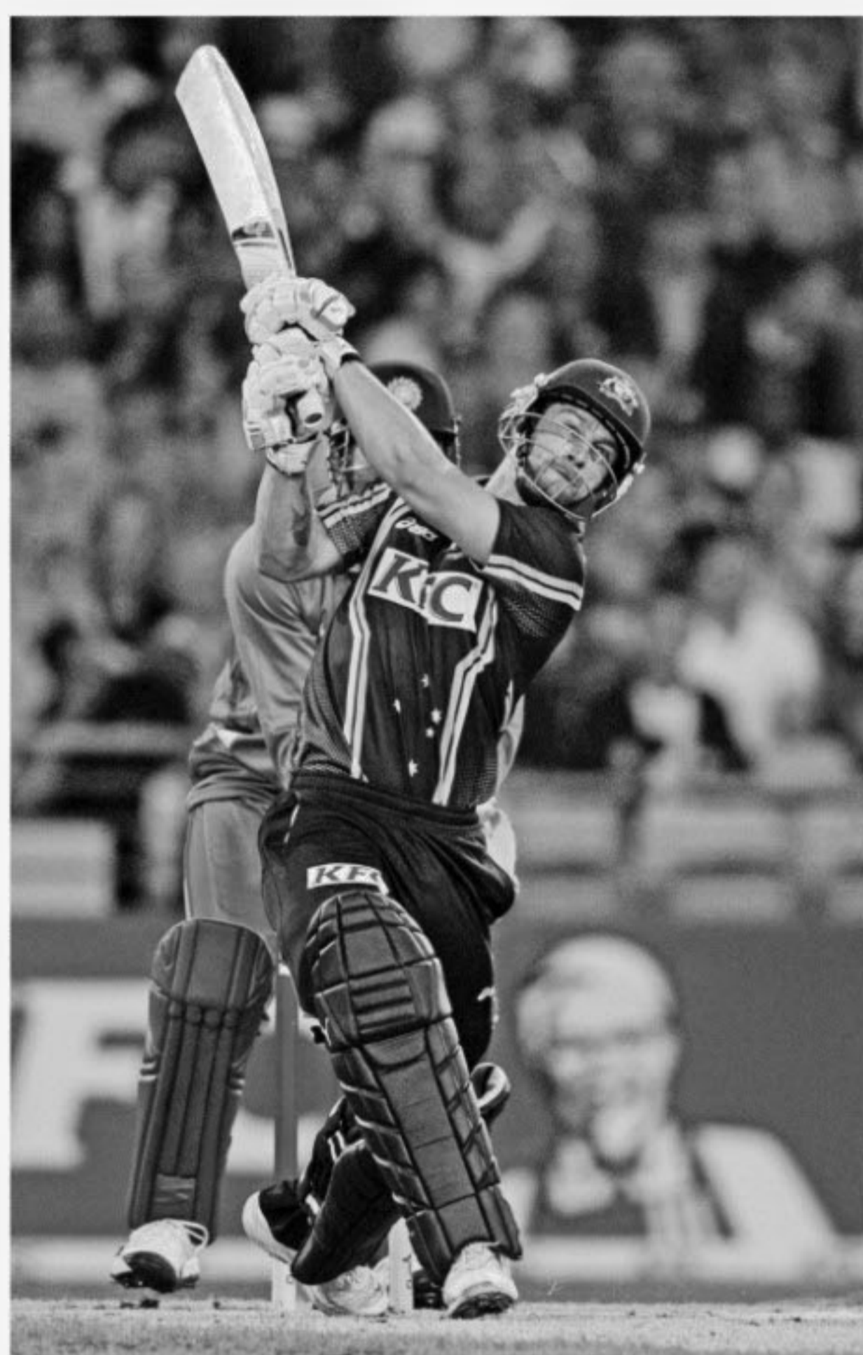
Matthew Wade of Australia hits out against India during their T20 International in Sydney yesterday.

Result: Australia won by 31 runs. Man-of-the-match: Matthew Wade. Toss: India.