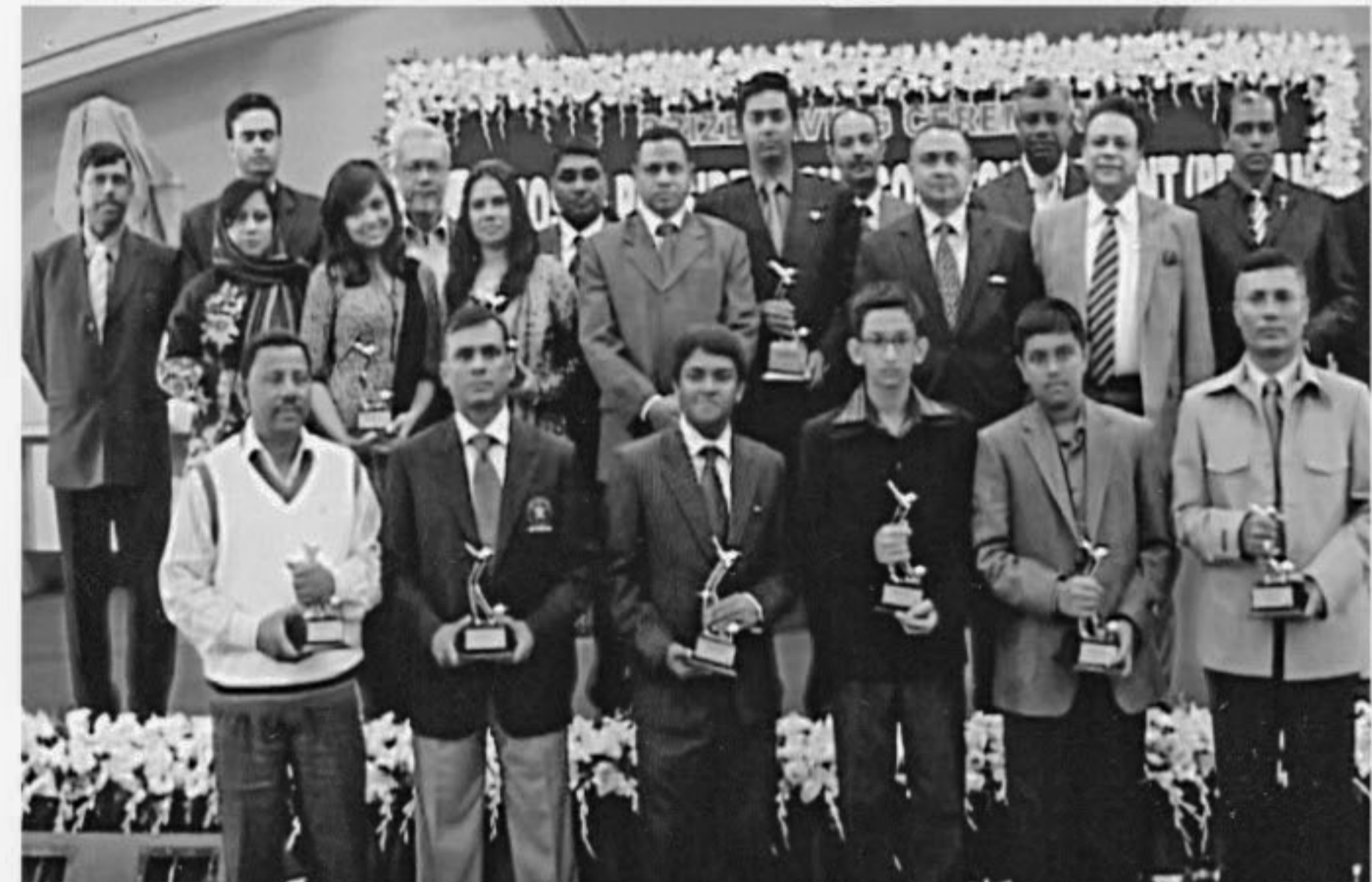
Winners and officials pose for a photo after the completion of the 8th Hosaf President Cup Golf Tournament at the Kurmitola Golf Club recently.

"When I used to get hit, I would devise new ways so that I can keep the batsmen quiet. I developed cutters, but these days I don't see anyone trying anything different and being accurate with it," he said.