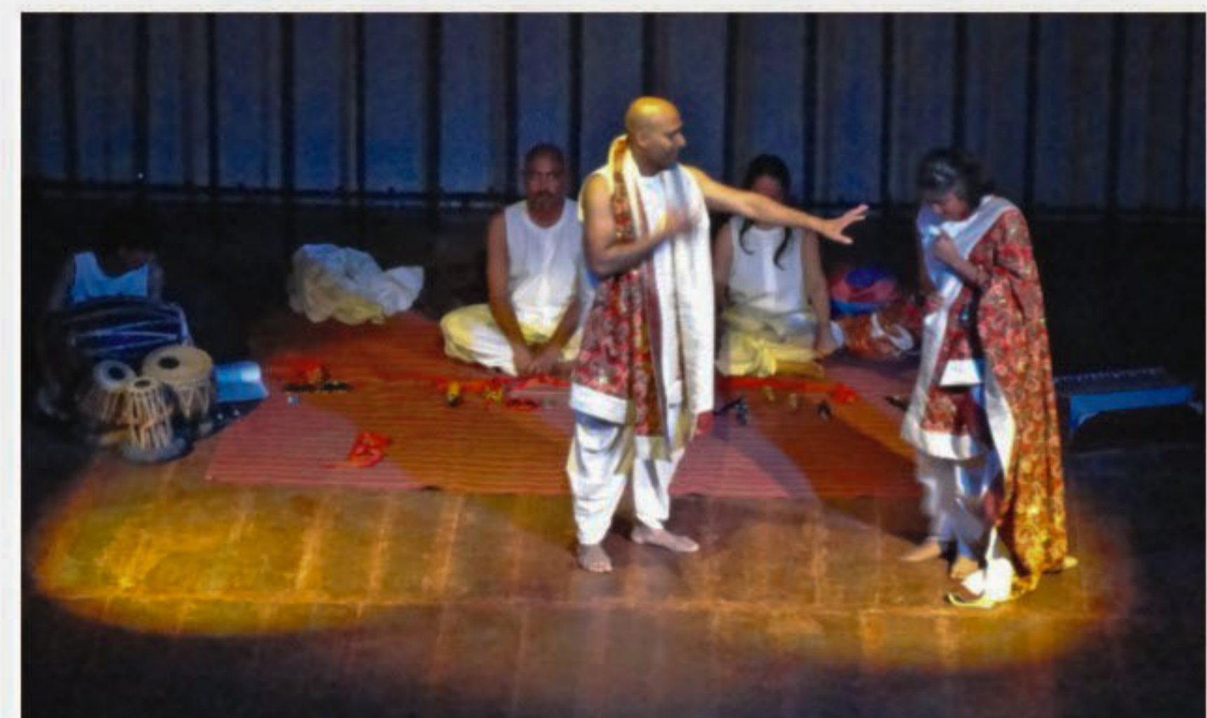
A scene from the play.