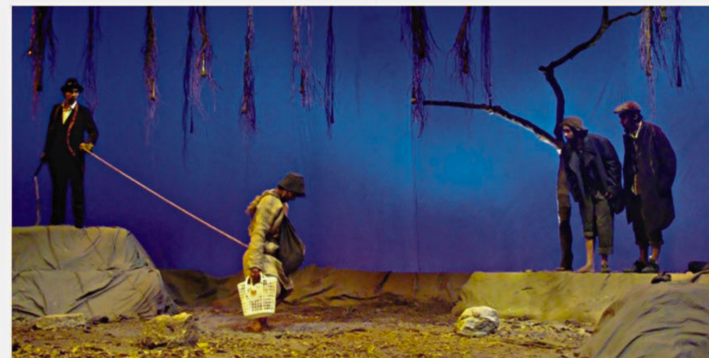
The play is considered the most notable work of Samuel Beckett.