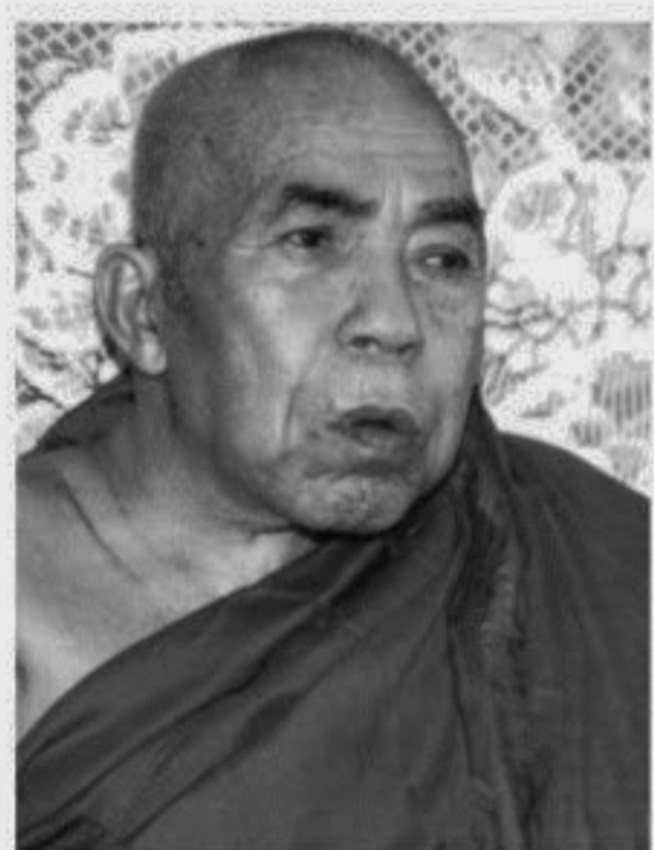
to the spiritual leader.

As the news of the demise spread, people from different hilly areas thronged the shrine to pay their homage