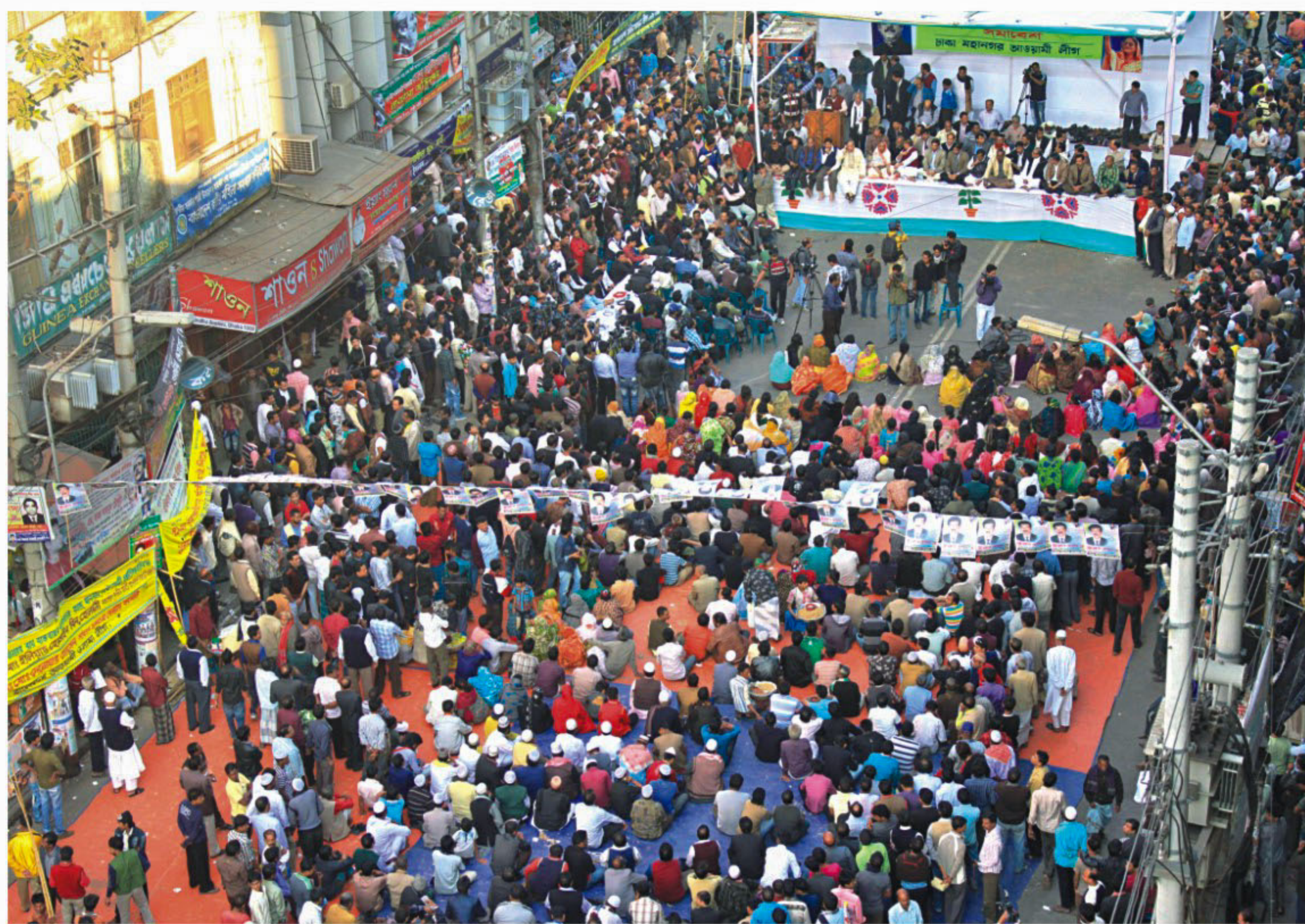
The Dhaka city unit Awami League holds a rally on the city's Bangabandhu Avenue yesterday, demanding immediate trials of war criminals and calling upon the people to resist any conspiracy to overthrow the government.