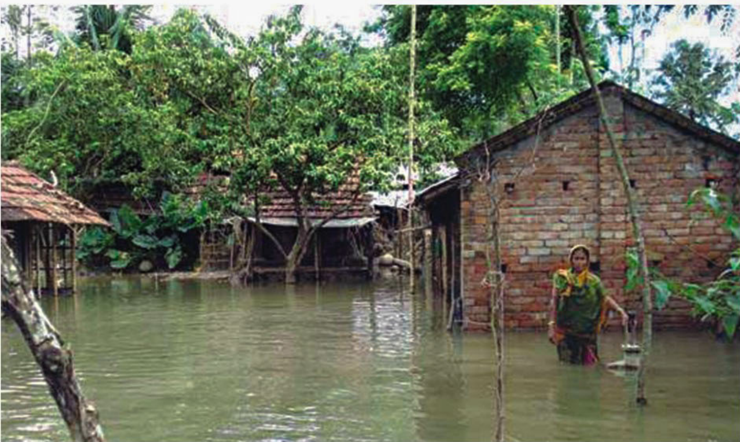
A woman standing in front of a submerged tube-well at Raritara village in Tala upazila of Satkhira district during flooding in August last year.