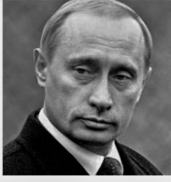
'likes' from readers.

"In such conditions it is important to secure the stable and gradual development of our economy, and as far as possible to protect our citizens from blows delivered by crises, while resolutely and quickly renewing