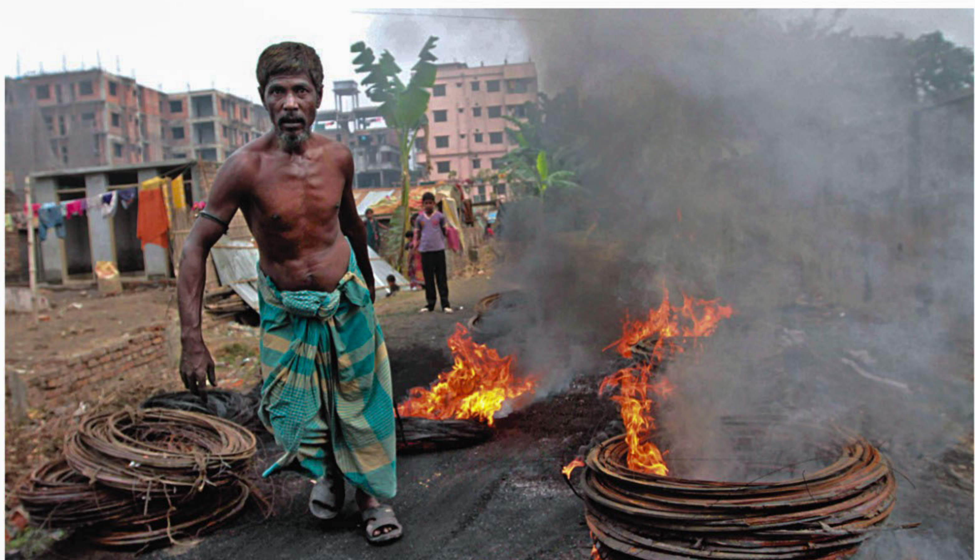
People burn tires in the capital's Mohammadpur Beribadh area to extract steel belts, producing smoke and toxic contaminants. Air pollution is rampant in Bangladesh, earning the country the second-from-last position on the Environment Performance Index 2012 in terms of air quality with its effect on human health. The photo was shot recently.

financial institutions lost 7.52 percent, followed by pharmaceuticals 6.50 percent, banks 6.46 percent, power 6.42 percent and telecom 4.63 percent. Market experts, however, did not find any logical ground for yesterday's steep fall in share prices. Rather, some of them anticipated an ill design by market influentials of pulling down the market to purchase shares at lower prices. "In recent times, I do not find any factor that may leave negative impact on the market," said Mirza Azizul Islam, a former finance adviser and a market analyst. "A recent issue of confusion over investment by the government employees in the share market has already been resolved. Neither the latest monetary policy put extra pressure on private sector, nor does it go against the stockmarket." Even, no big political violence is seen in the political ground. The latest political instability is not enough for a big fall in the market, said Aziz, also a former chairman