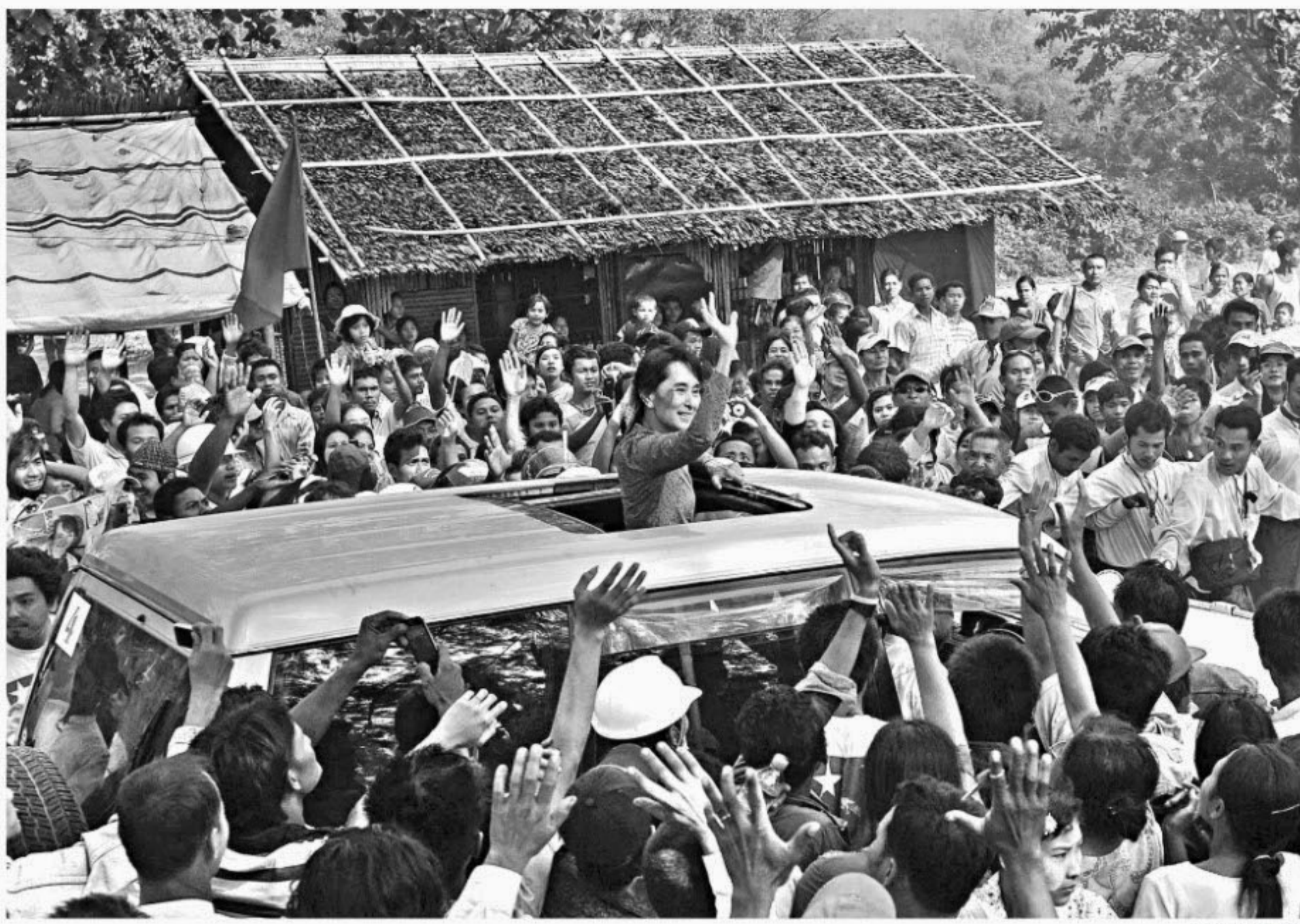
Myanmar opposition leader Aung San Suu Kyi waves to supporters as she leaves after addressing a gathering as part of her campaign trail on the outskirts of Myanmar's southern city of Dawei yesterday.