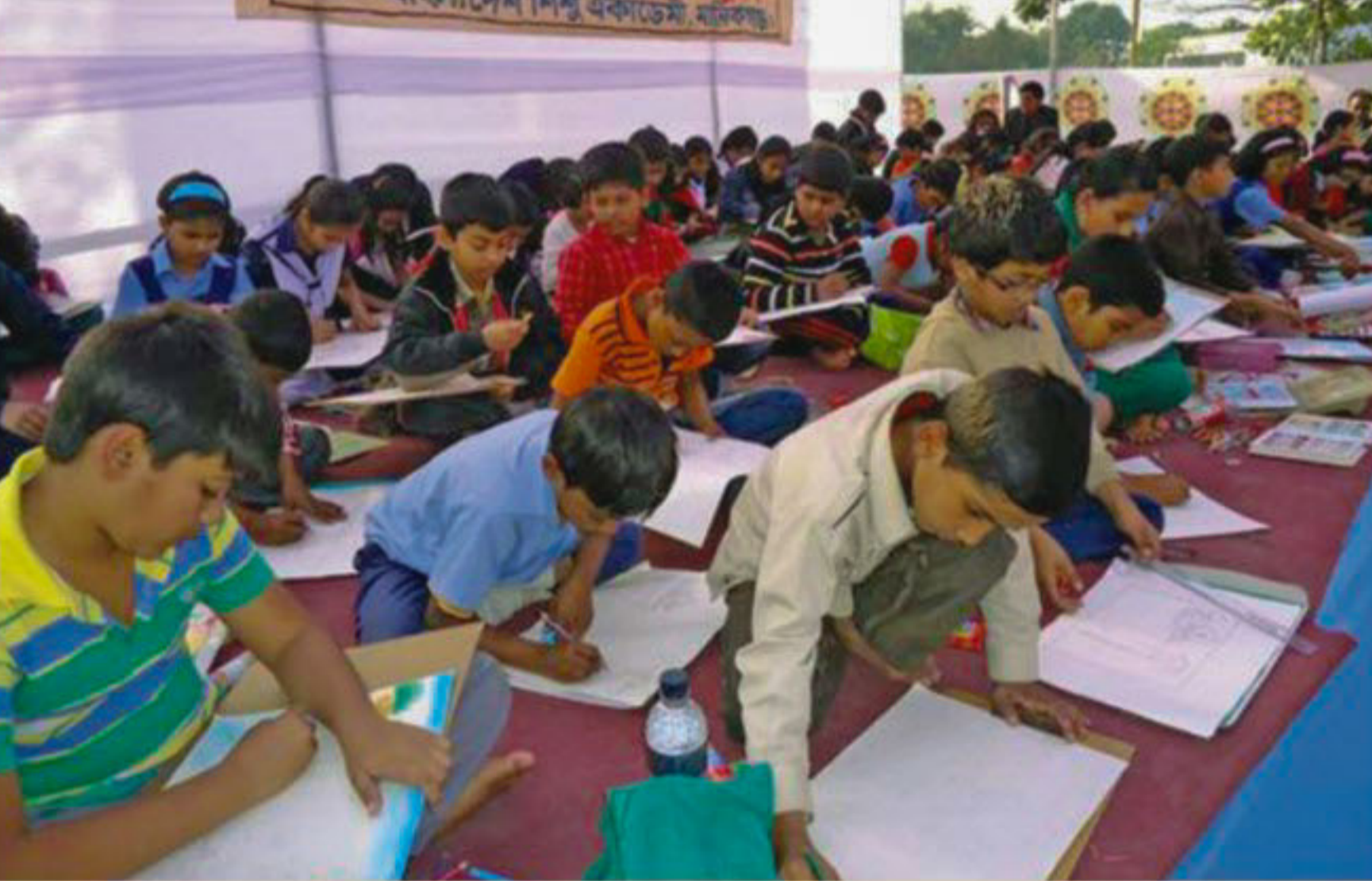
Hundreds of school children participated in the competition.