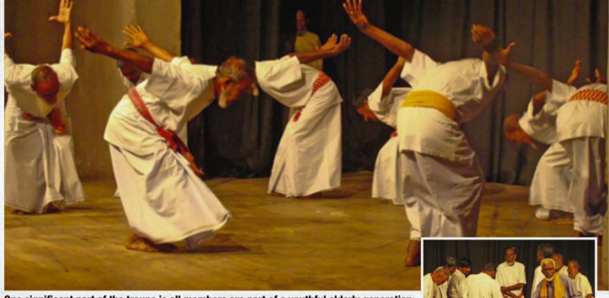
One significant part of the troupe is all members are part of a youthful elderly generation.

Muharram-er Jari, nurtured and practiced in the South-Eastern part of the country, is a unique indigenous performing art form that combines the tragic tale of Karbala with elements incorporated from the rural lifestyle. Whereas the theatre form incorporates the story of Imam Hassan and Imam Hussain, it takes elements from the life of a rural individual, for instance, Zainal, who empathises with the tragedy of Karbala. Referring to the rivers Padma and Surma that have an affinity with the telling of the Karbala tale. As part of the ongoing 5th Dhaka University Central Theatre Festival, Muharram-er Jari was performed at the Natmandal Auditorium of DU campus, on January 25. A troupe from Comilla demonstrated the performing art. Organised by the Department of Theatre, DU the festival has been staged at Natmandal and at the TSC auditorium.