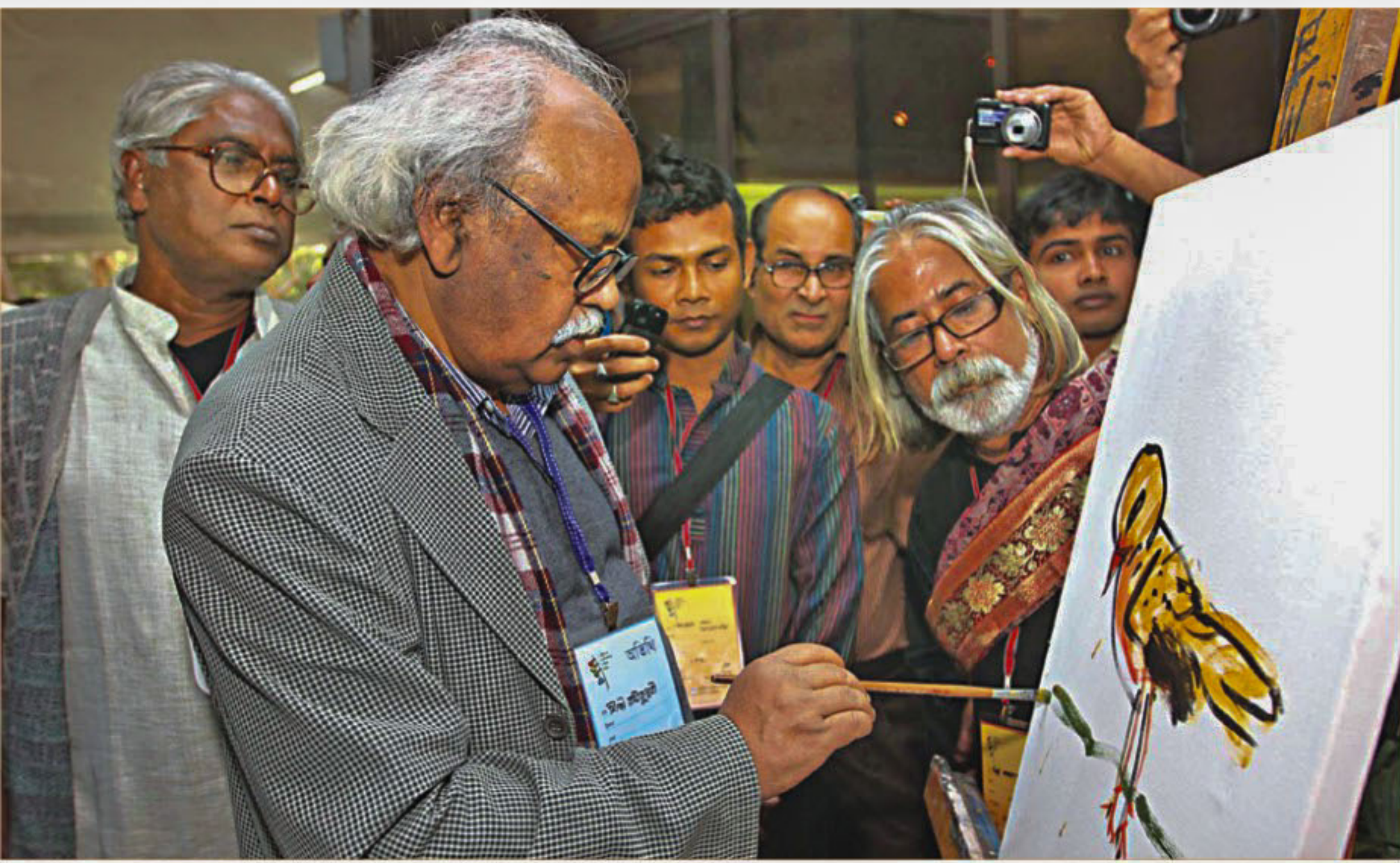
Artist Rafiqunnabi strokes his brush on a canvas to inaugurate an art exhibition at Institute of Fine Arts of Chittagong University yesterday. The exhibition is part of a three-day celebration marking the institutionalisation of fine arts in Chittagong through the establishment of the former Department of Fine Arts in Chittagong University and Chittagong Art College.