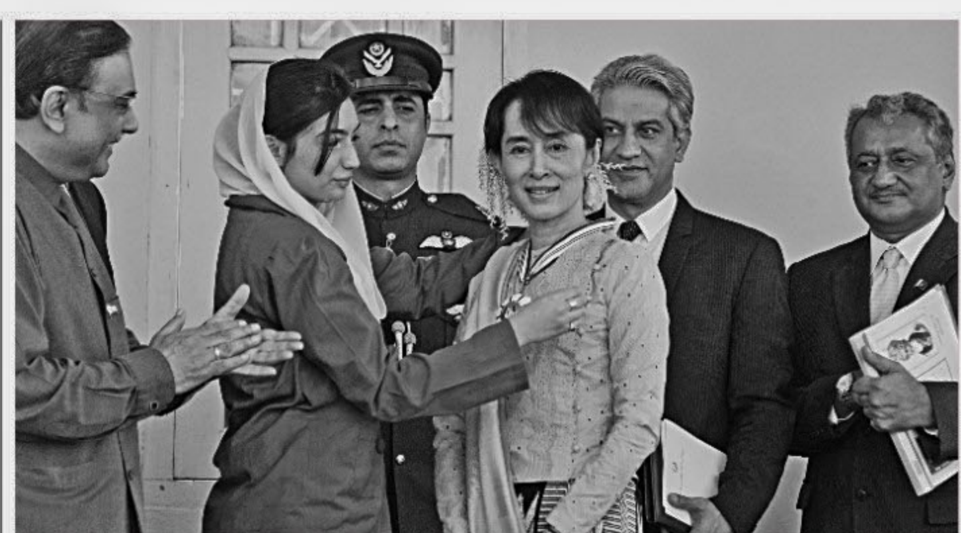
Myanmar democracy icon Aung San Suu Kyi, centre, smiles after she received the Shaheed Benazir Bhutto award from Pakistani president Asif Ali Zardari's daughter at her house in Yangon yesterday. Zardari arrived in Myanmar on January 24 for two days of talks and a meeting with veteran democracy advocate Aung San Suu Kyi.

"It was really huge. It covered 42 houses and only three or four people managed to escape. Everyone else died," he said. Describing a scene of "utter devastation" he said tonnes of mud and stones came down in the landslide and "destroyed the whole area."