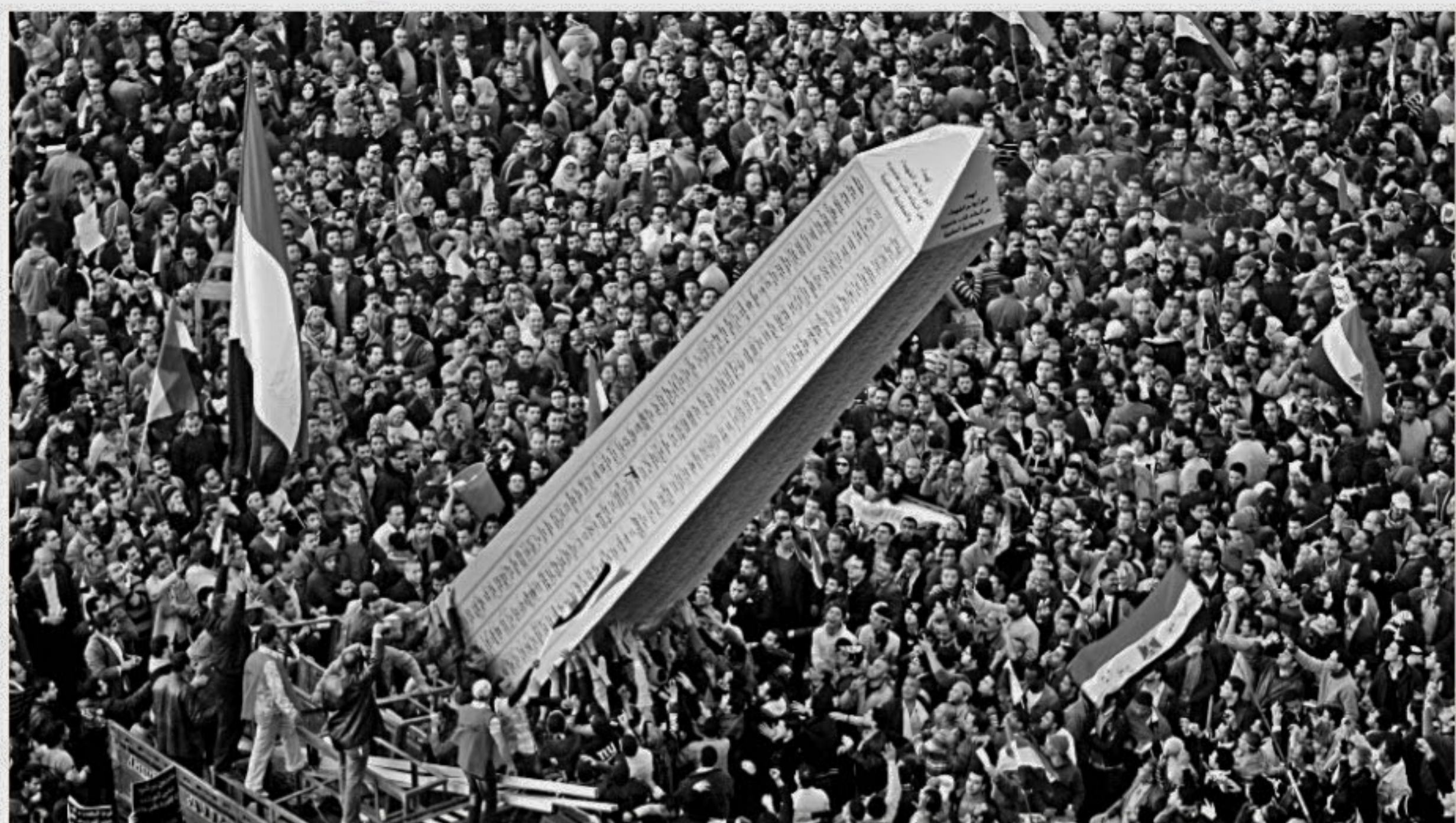
Egyptian protesters carry an obelisk with the names of those killed during last year's uprising, at a huge rally in Tahrir Square yesterday, marking the first anniversary of the uprising that toppled president Hosni Mubarak as a debate raged over whether the rally was a celebration or a second push for change.

But some people in the square said the protests should end and the new leaders be given time to move Egypt forward.