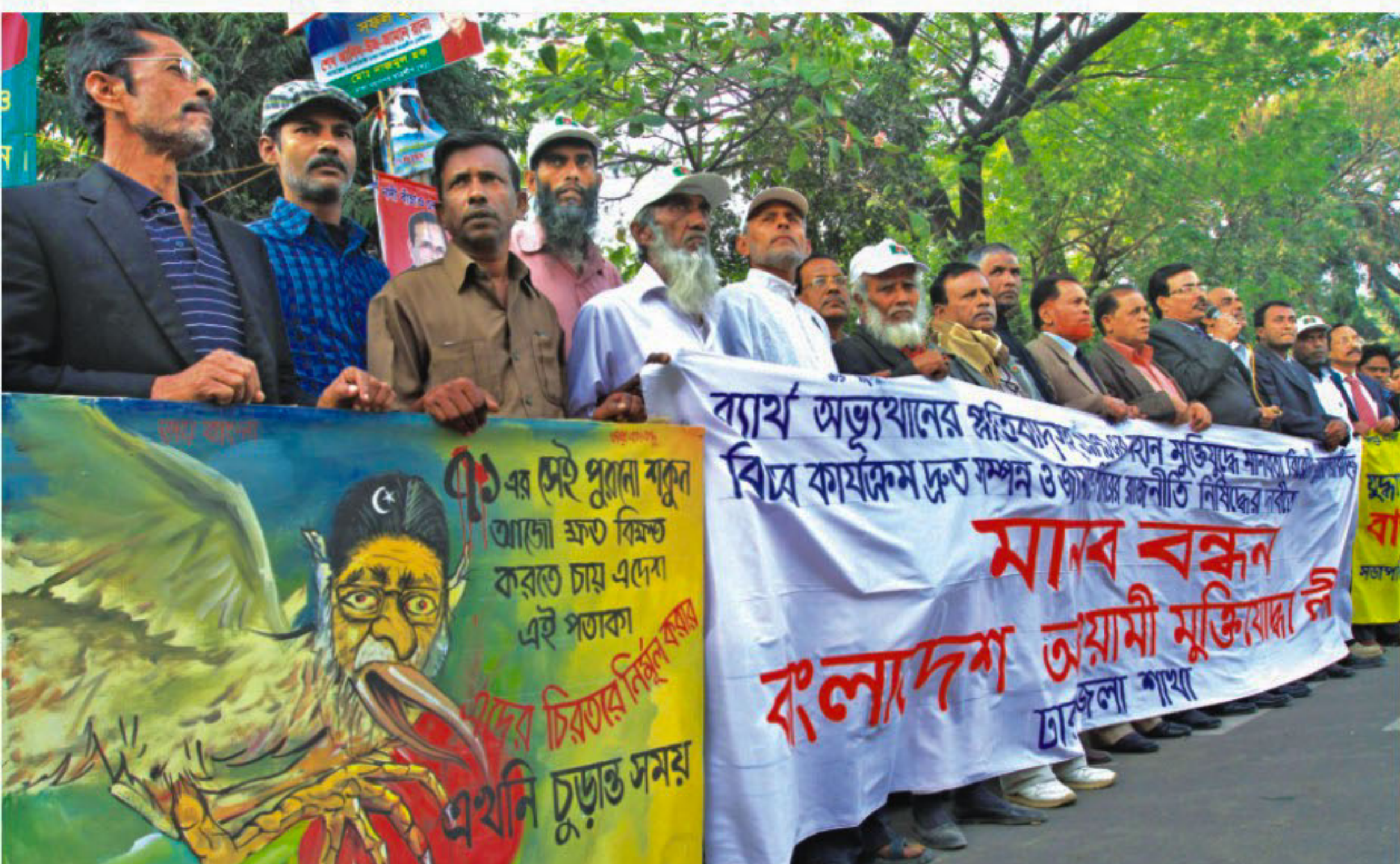
Bangladesh Awami Muktijoddha League forms a human chain before Jatiya Press Club yesterday protesting the recent plot in army to topple the government.

The court fixed February 6 for starting the trial of the case.