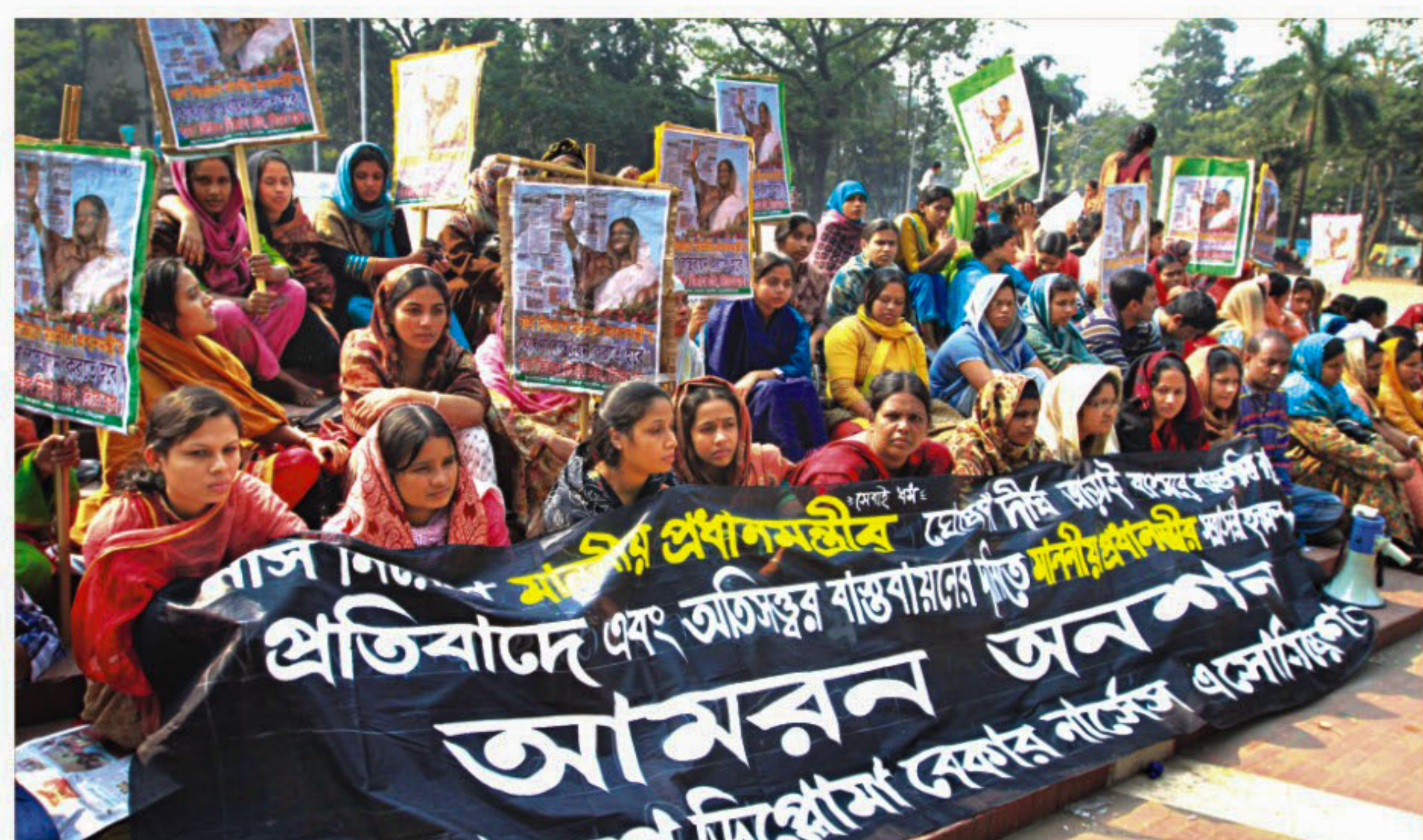
Bangladesh Diploma Bekar (unemployed) Nurses Association starts fast-unto-death programme at Central Shaheed Minar yesterday to get appointment immediately.