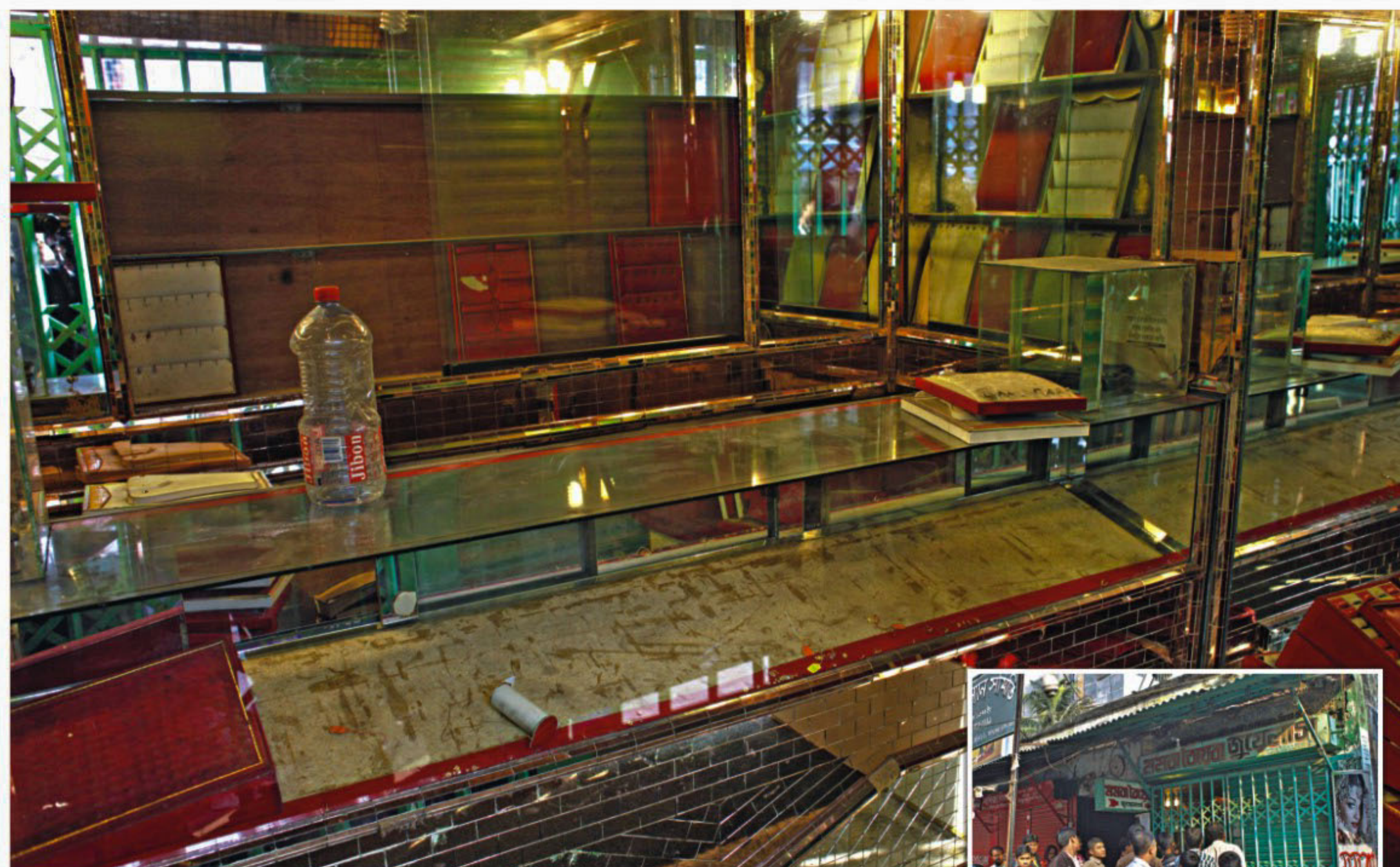
The inside of the looted jewellery shop, Mamata Taiba Jewellers, at Janakalyan Samity Market in the city's Mirpur. Inset, people peeping through the shutter which was broken during the robbery yesterday.

None was arrested and no gold ornament was recovered till filing of this report last night.