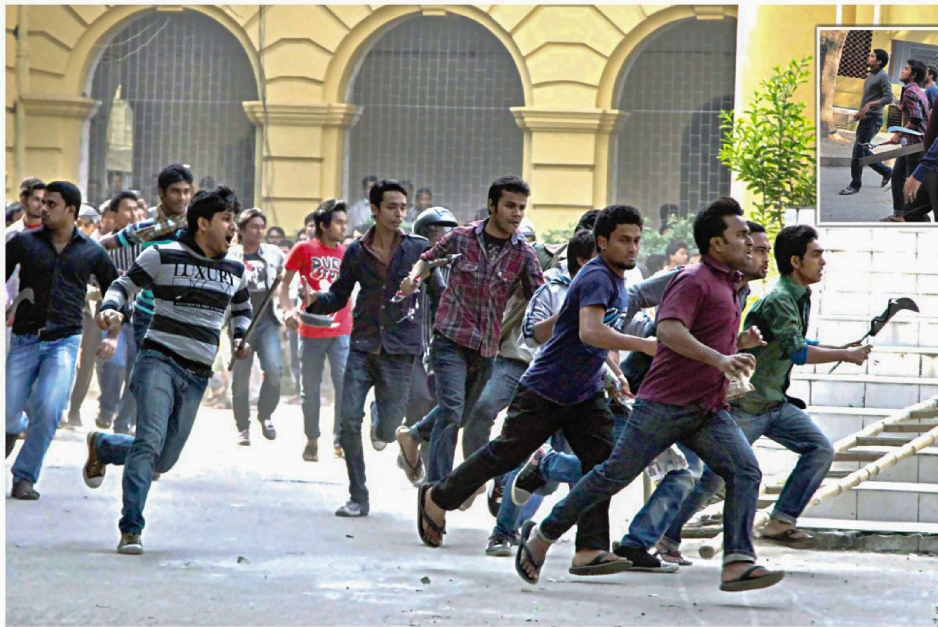
Weapons wielding activists fight running battles with rivals as a factional feud of Bangladesh Chhatra League erupts at Jagannath University yesterday. Story on page 2.