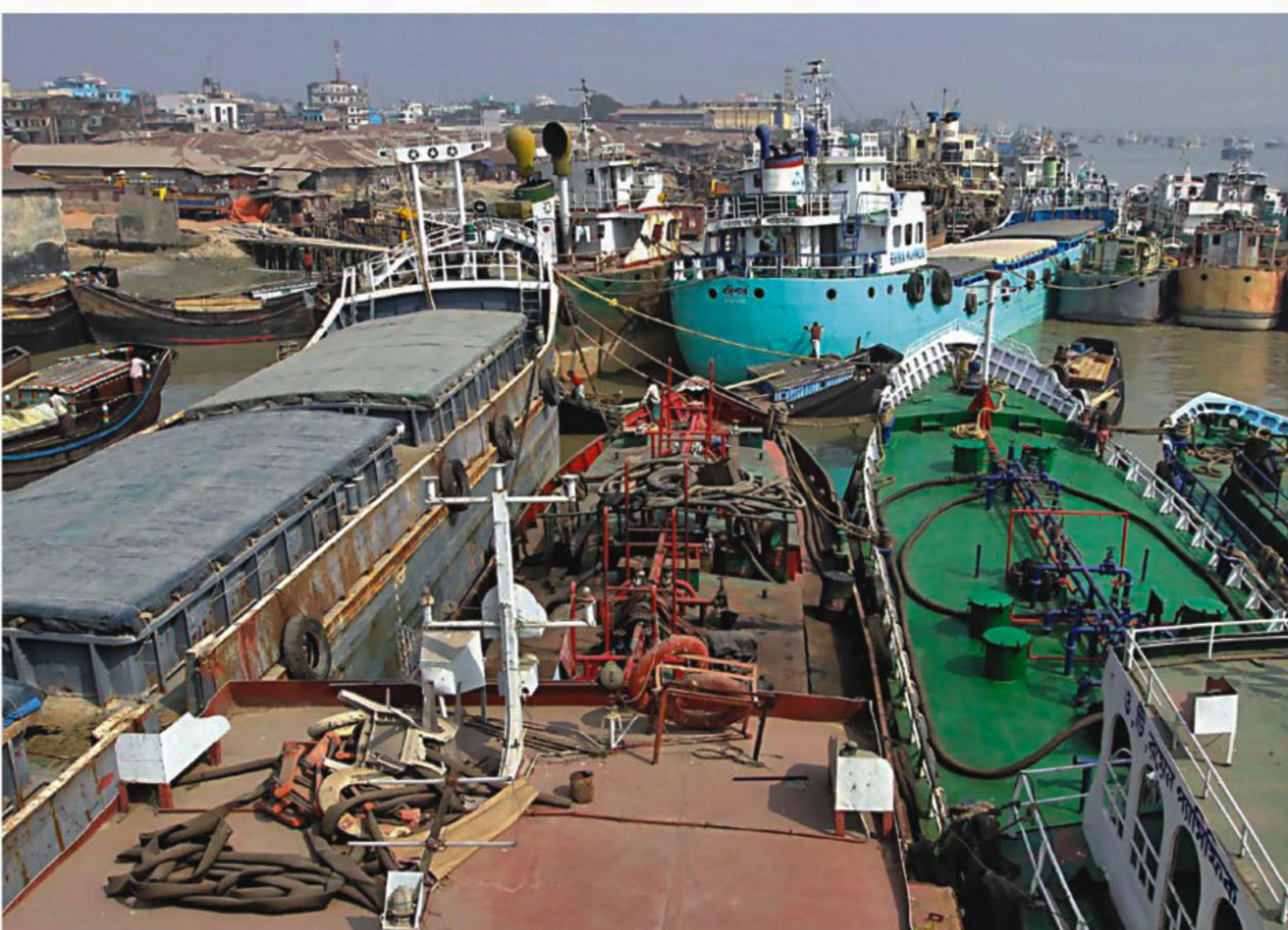
Goods vessels lie idle in the port city during a strike called by workers of jetties and warehouses yesterday to press home their demands, including a pay rise. Story on page 5.