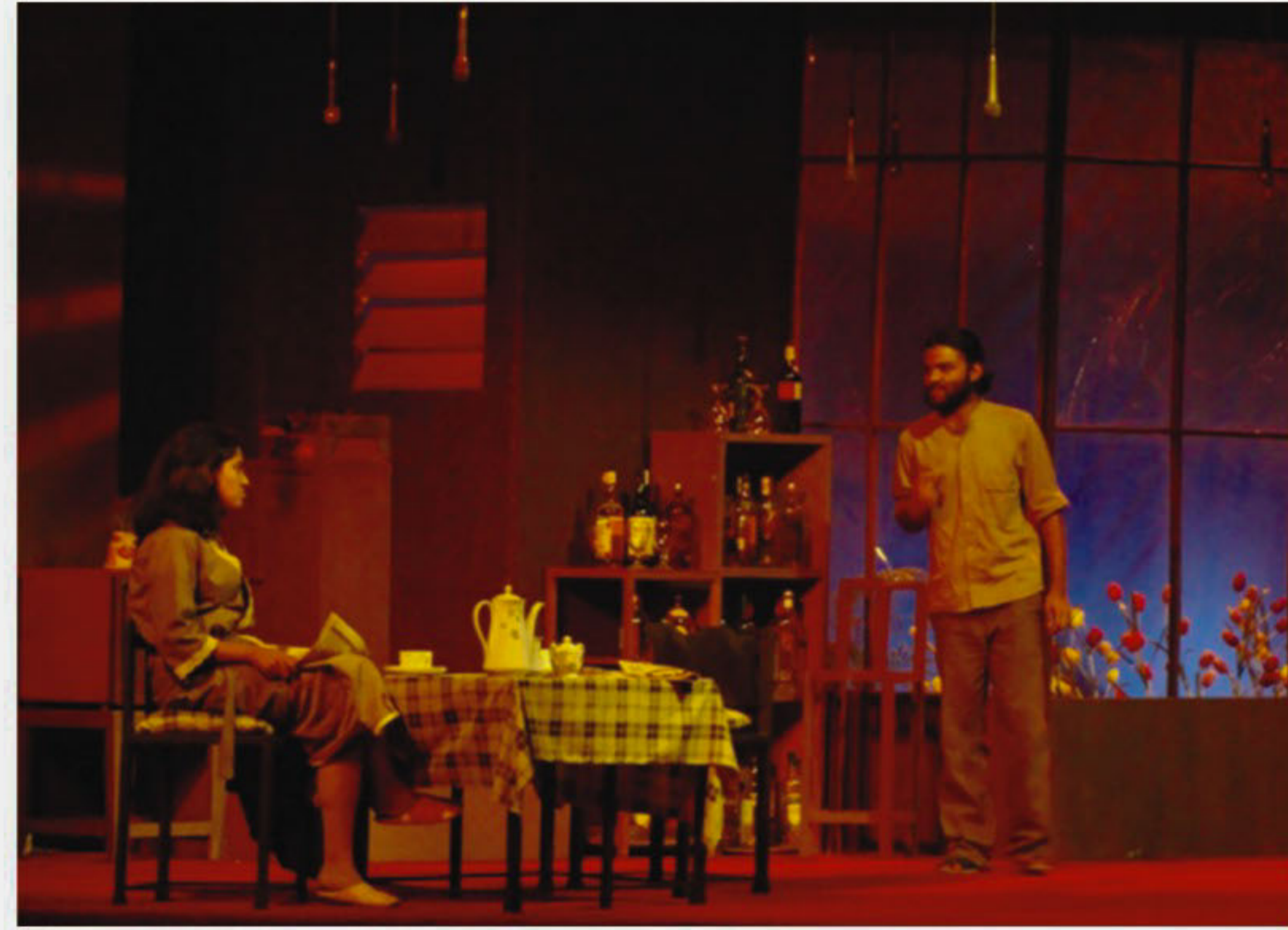
Scenes from "A Slight Ache" (top) and "Genius and Culture".