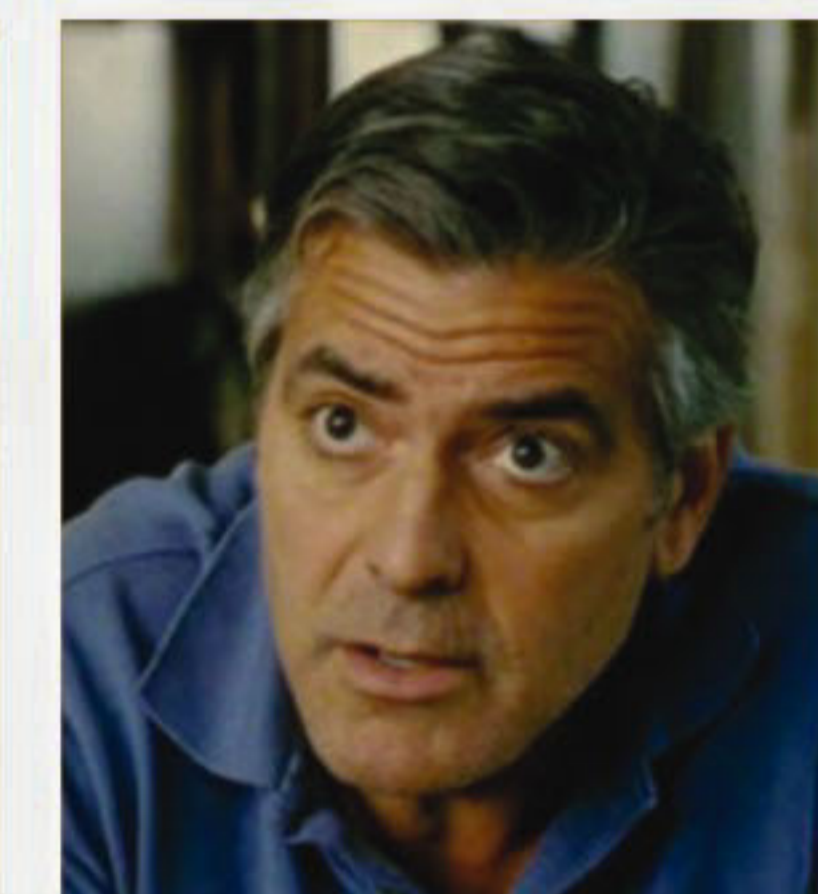
Meryl Streep and George Clooney are tipped to get acting nominations.