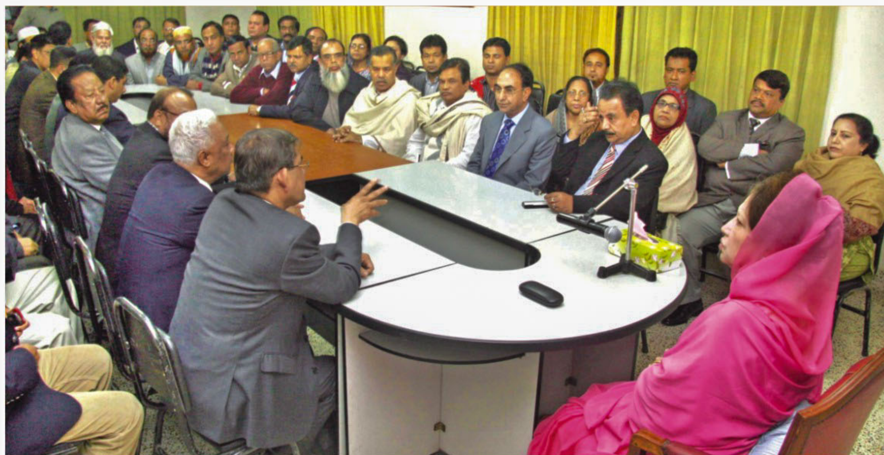
BNP Chairperson Khaleda Zia holds a discussion with the leaders of Dhaka city and Dhaka district units at her Gulshan office in the city yesterday.

The BNP leader noted with regret that the Indian daily was not only against his party but also launched propaganda against Bangladesh.