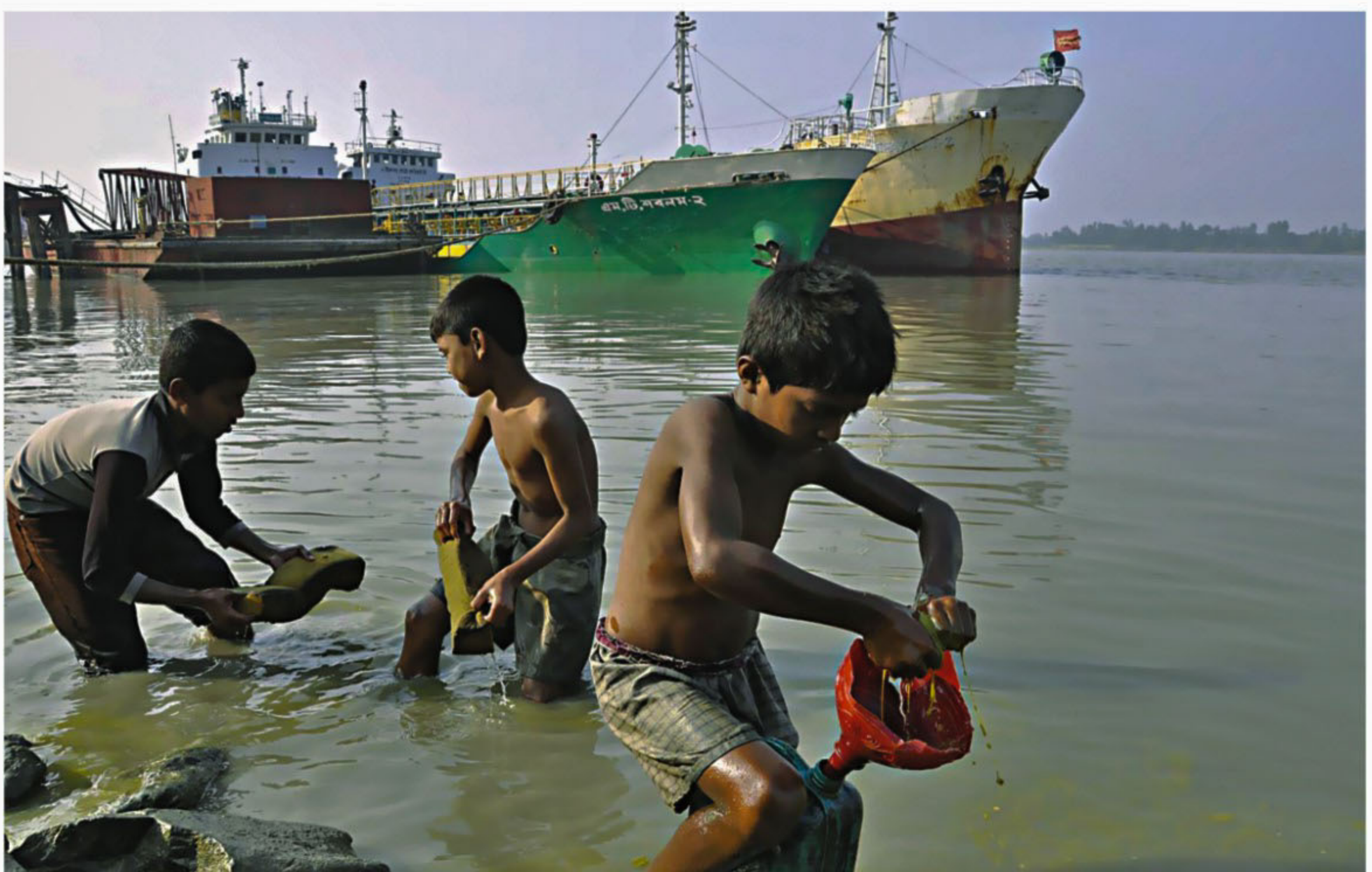
Local kids collect oil spilling from a tanker which developed a leak when it was hit by a pilot training ship while anchoring near Chittagong Port yesterday.