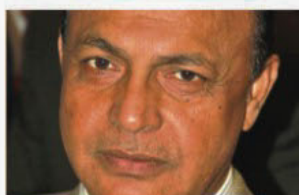
Lt Gen (retd) Harun-Ar-Rashid