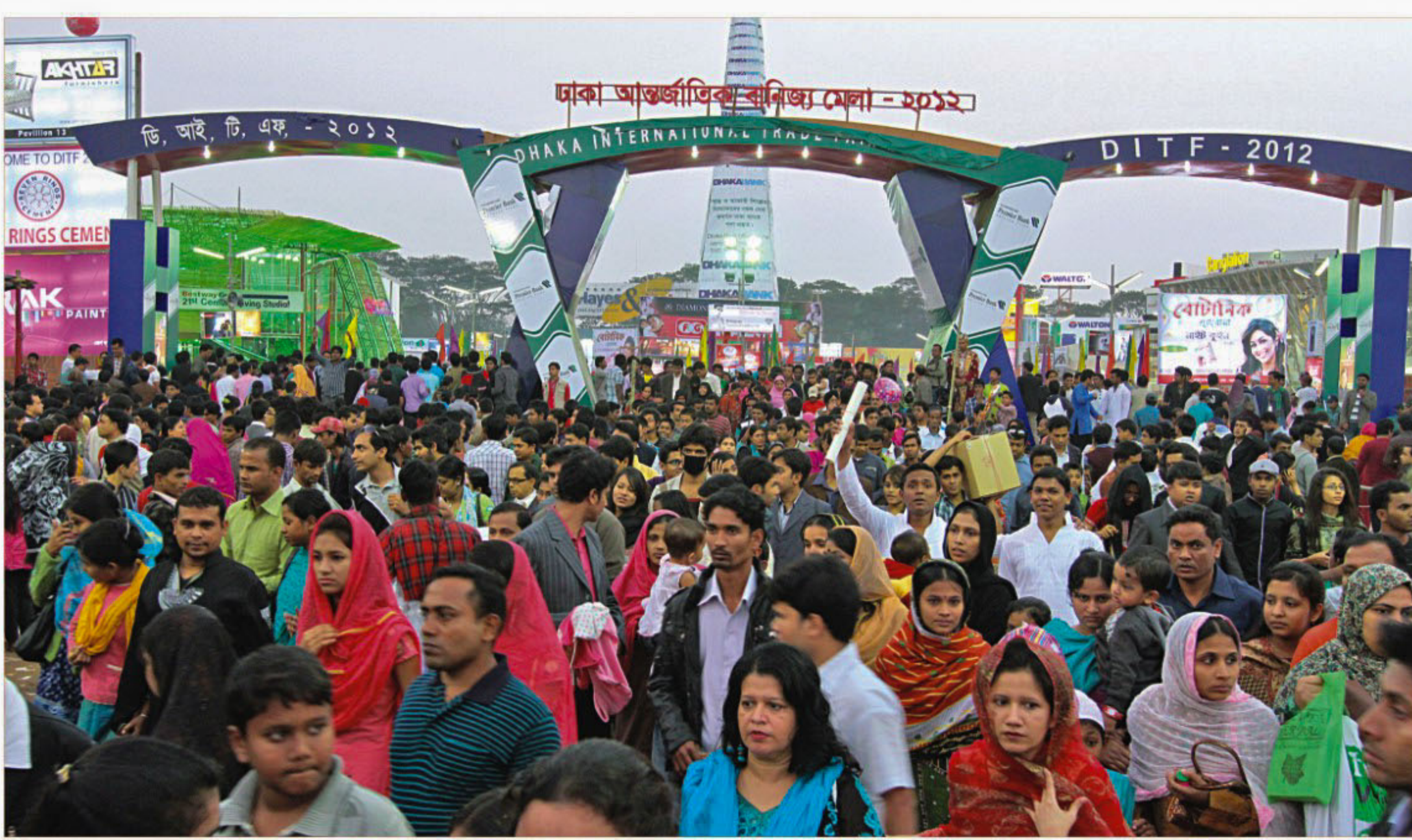
Dhaka International Trade Fair draws a vast crowd on the weekend yesterday. Story on page 2.