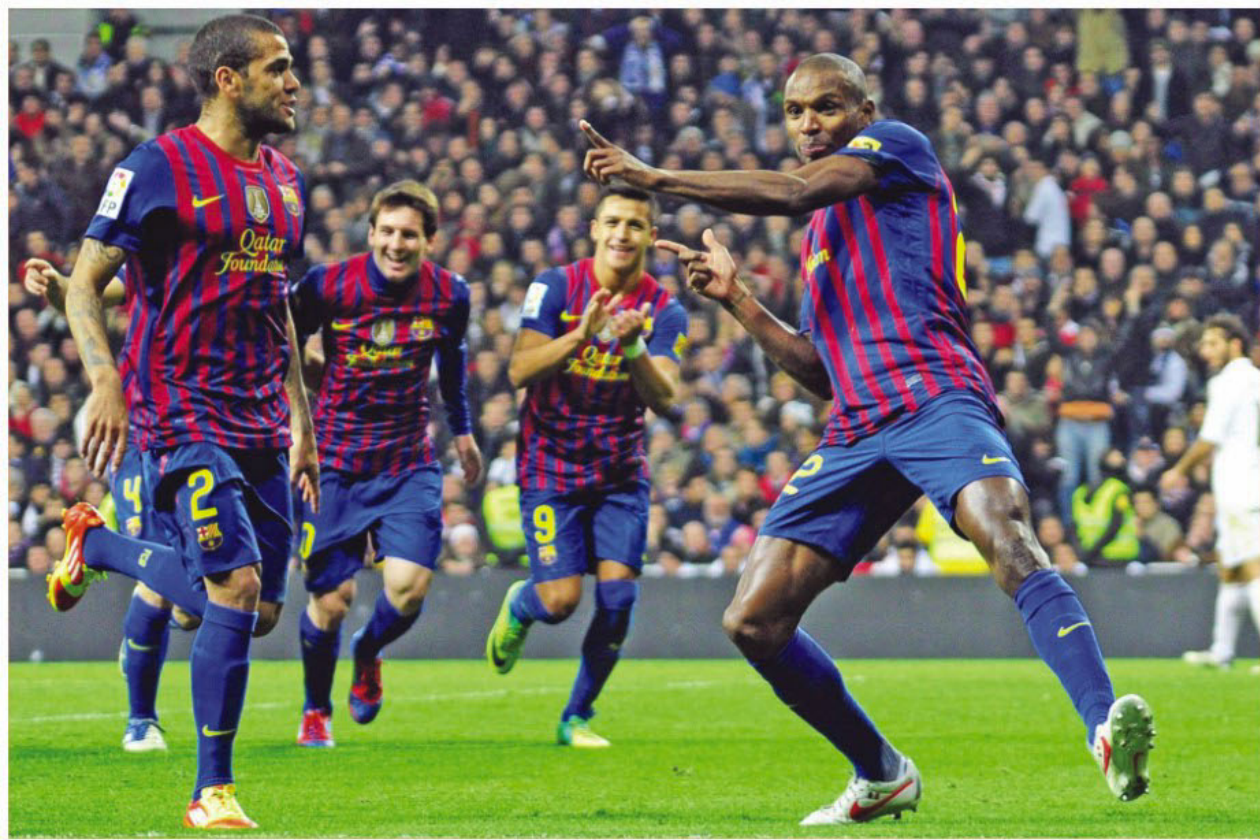
Barcelona defender Eric Abidal (R) celebrates his winning goal against Real Madrid during their Spanish Cup match at Bernabeu on Wednesday.

A familiar silence came down over the Santiago Bernabeu, the home fans had seen it all before and although Madrid tried sporadically for a way back into the game Barca rarely ceded them the ball.