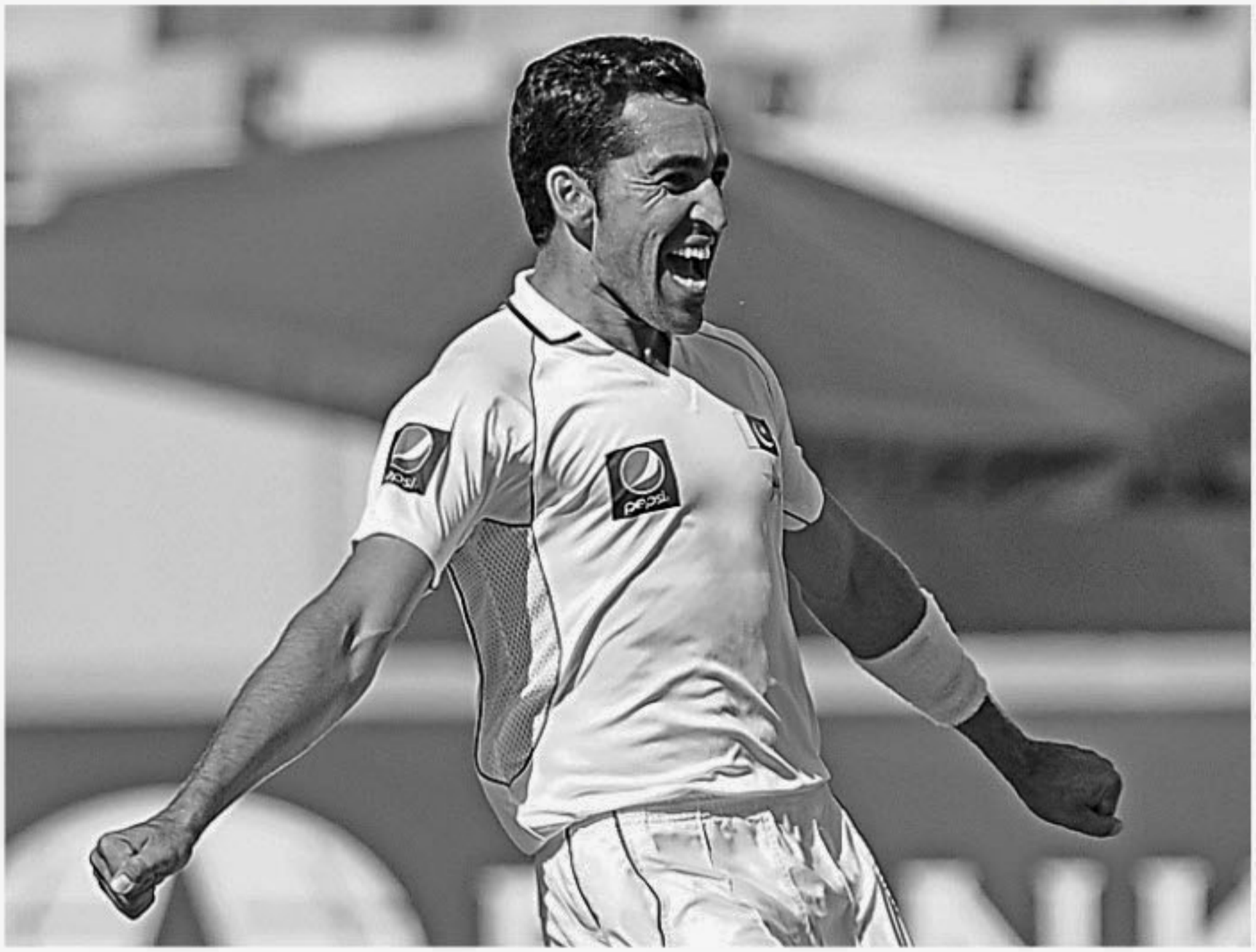
Pakistan pacer Umar Gul is ecstatic after dismissing England batsman Kevin Pietersen for a duck during the third day of the first Test at the Dubai Stadium yesterday.

Strauss instantly challenged the verdict but was left to tudge off the field after television umpire Steve Davis of Australia upheld the original decision.