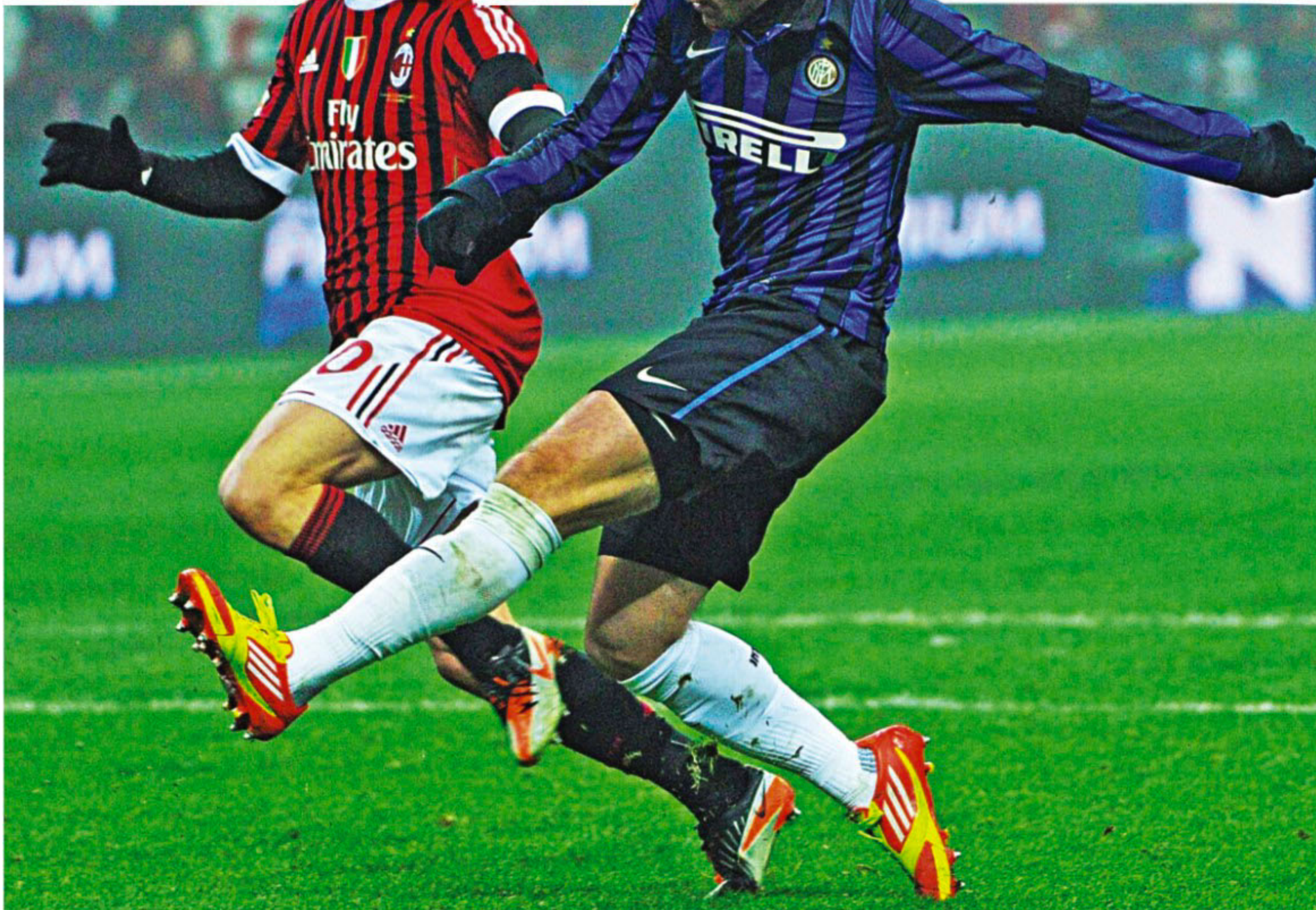
Inter Milan striker Diego Milito (R) scores the all-important goal during their Serie A encounter against AC Milan at San Siro on Sunday.

Zanetti surged past two players and then crossed to Milito. Abate looked set to cut it out but he missed the ball, allowing the Argentine striker to carry it forwards and slip the ball inside Abbiati's far post.