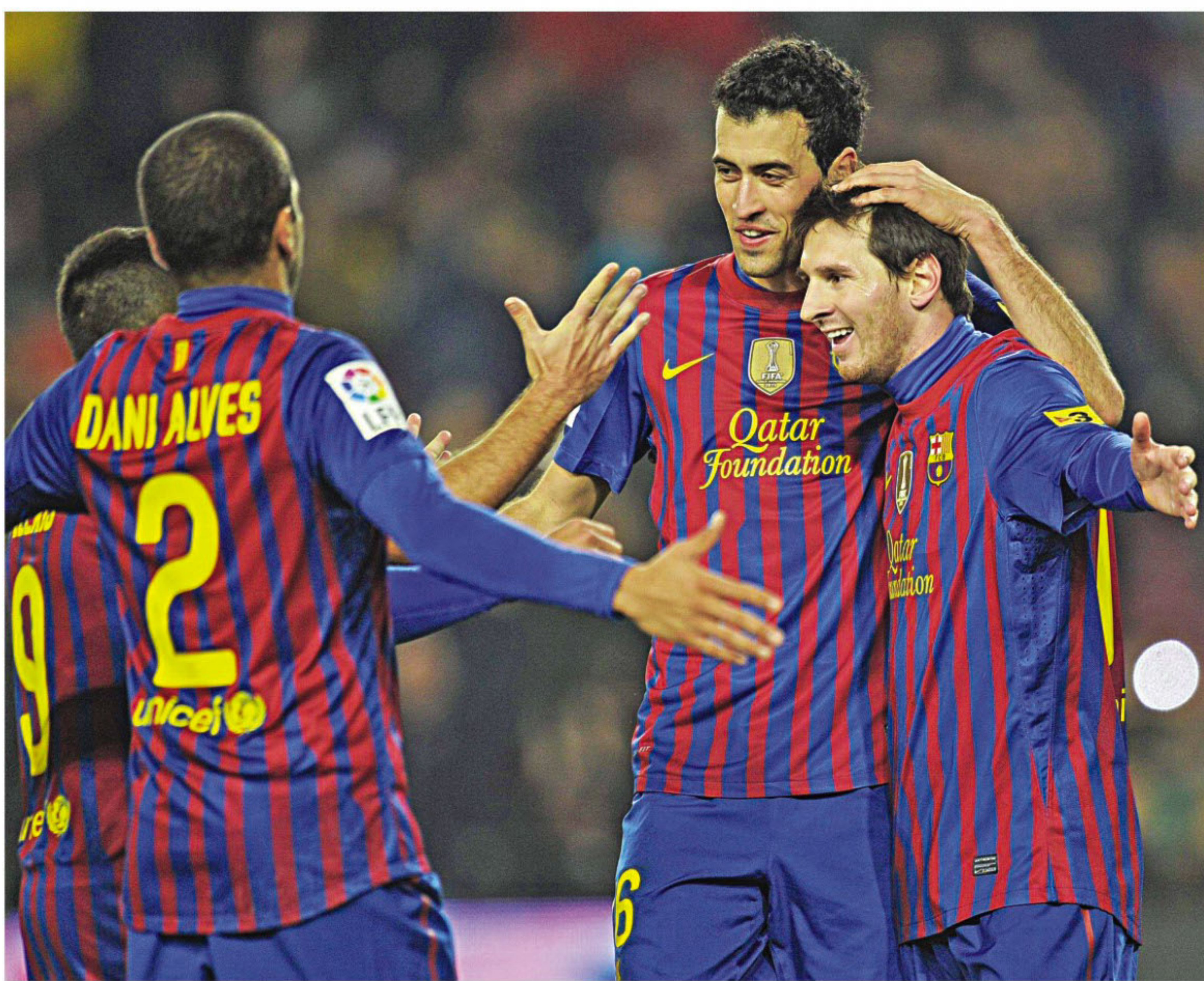
Barcelona superstar Lionel Messi (R) celebrates one of his two goals with teammates during their Primera Liga clash against Real Betis at Nou Camp on Sunday.

Atletico Madrid 3 (Falcao 40, 51-pen, Ribas 80) Villarreal 0 Osasuna 0 Racing Santander 2 (Stuani 39-pen, 70-pen) Athletic Bilbao 0 Levante 0 Sporting Gijon 2 (Galvez 36, Trejo 90+2) Malaga 1 (van Nistelrooy 88) Barcelona 4 (Xavi 10, Messi 12, 86-pen, Sanchez 75) Real Betis 2 (Ruben Castro 32, Santa Cruz 52)