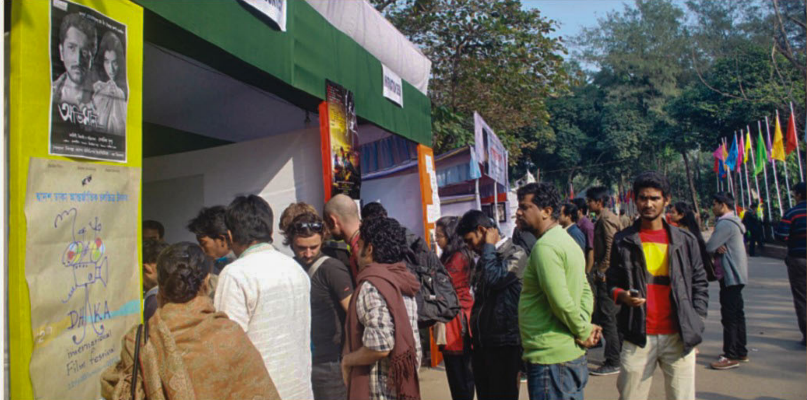
Film enthusiasts at Central Public Library premises, the main venue of the festival.

JAMIL MAHMUD An international film festival is always significant in terms of exchange of views among filmmakers and enthusiasts from different nations. As the 12th Dhaka International Film Festival (DIFF) is on, and a significant number of foreign delegates are here in Dhaka, some local filmmakers and activists share their views on the festival.