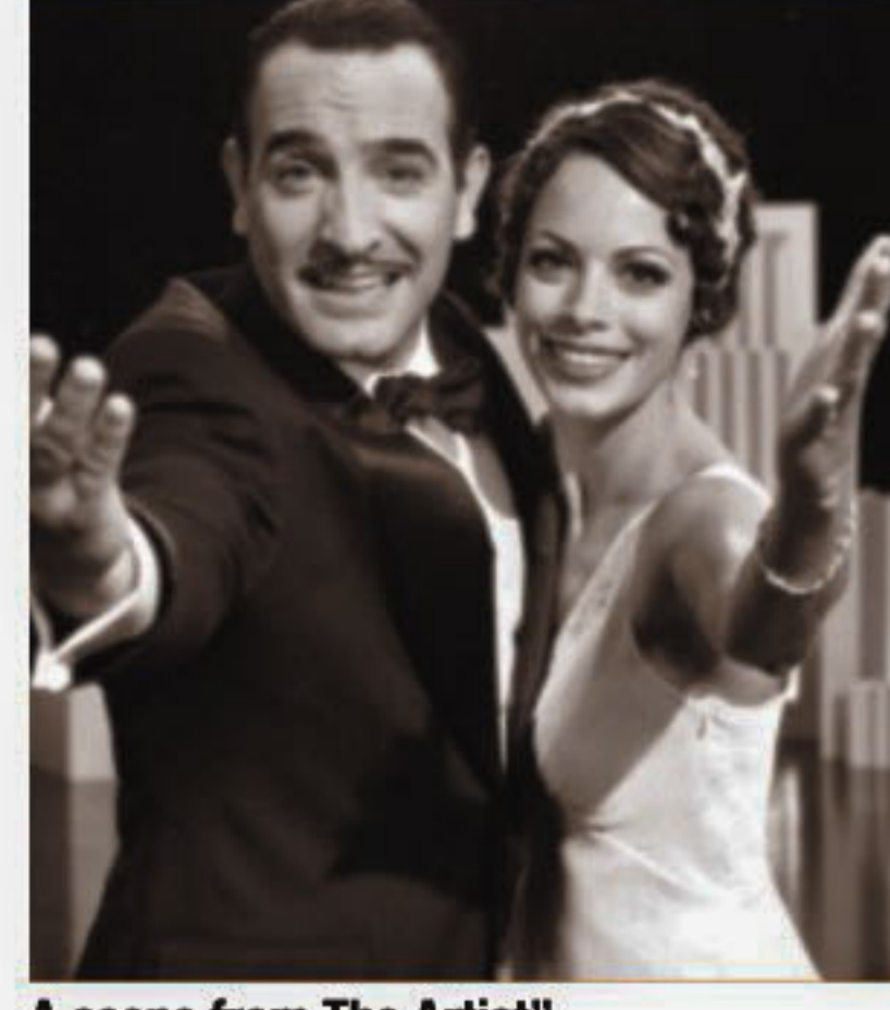
A scene from 'The Artist' featuring Jean Dujardin and Bérénice Bejo.

Silent film "The Artist" was the big winner at this year's Critics' Choice Awards, winning four prizes. The movie took the evening's top award, best picture, as well as best score, best costume design and best director for France's Michel Hazanavicius.