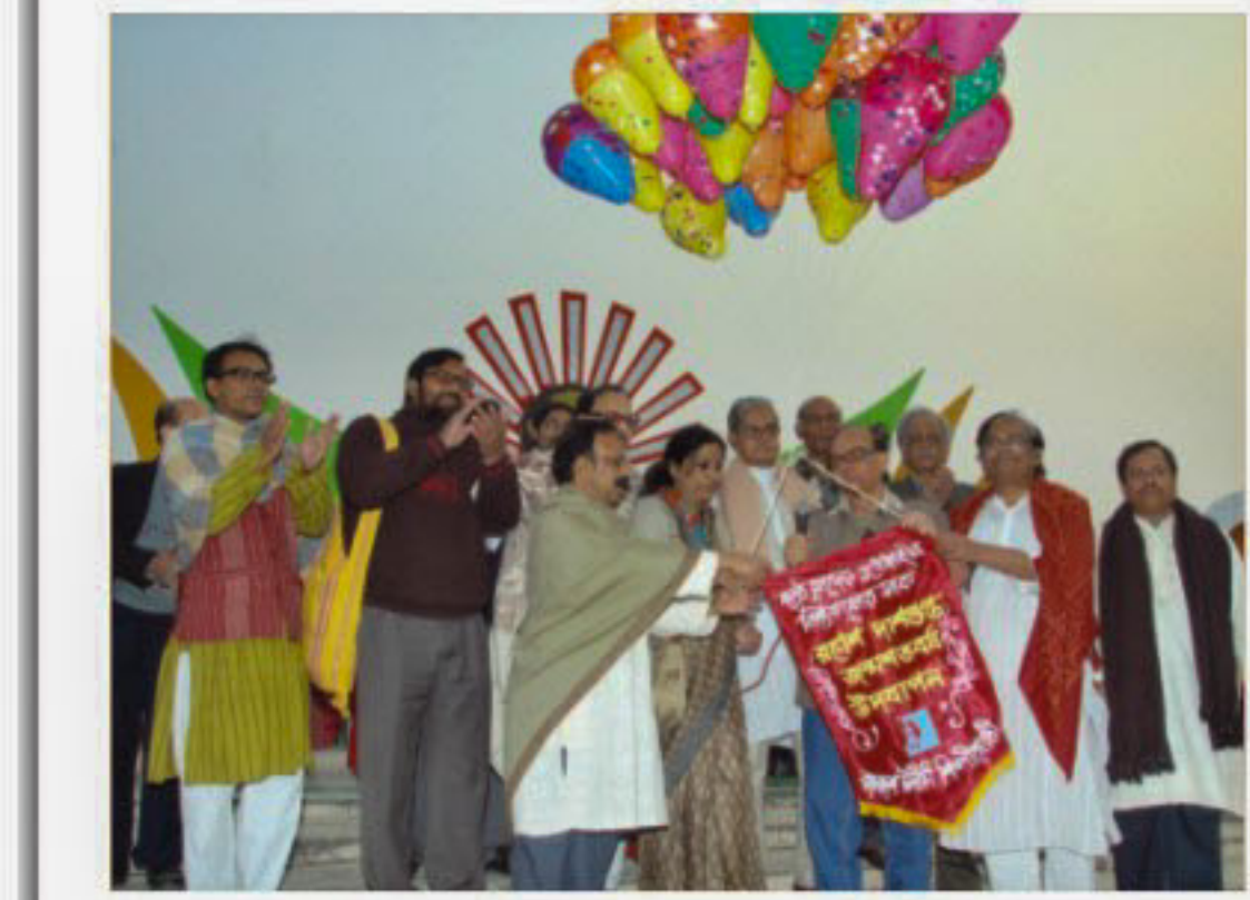
Dignitaries inaugurate the festival.