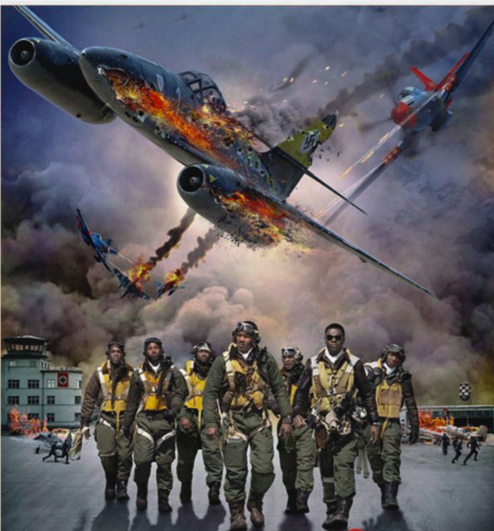
Poster of "Red Tails".

"This [film] costs more than what those movies make," Lucas added. Director and actor Perry, whose movies include "Why Did I Get Married" and the "Madea" series, is one of the most profitable filmmakers