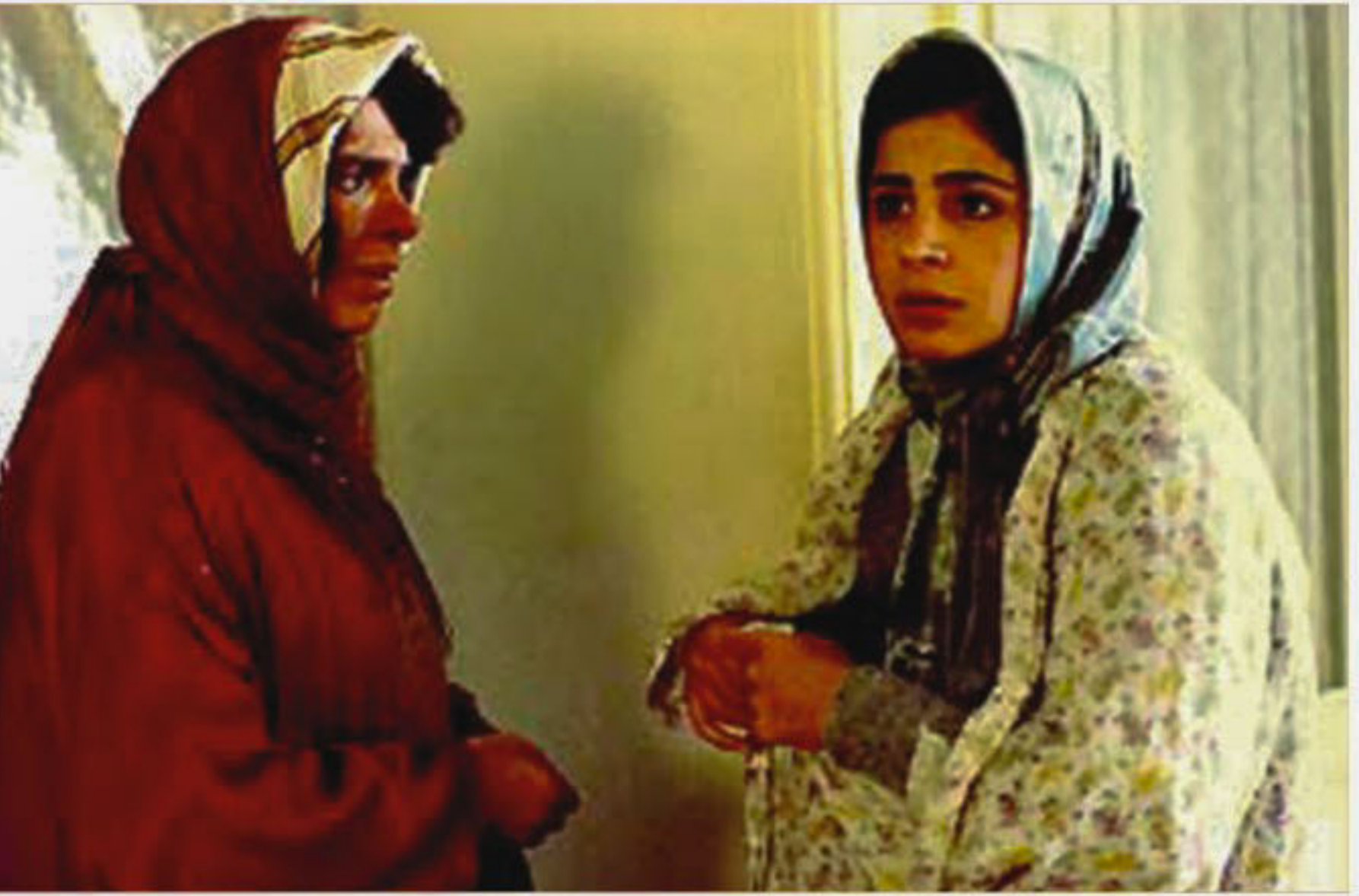
Mehrjui's "Banoo" will be screened today.