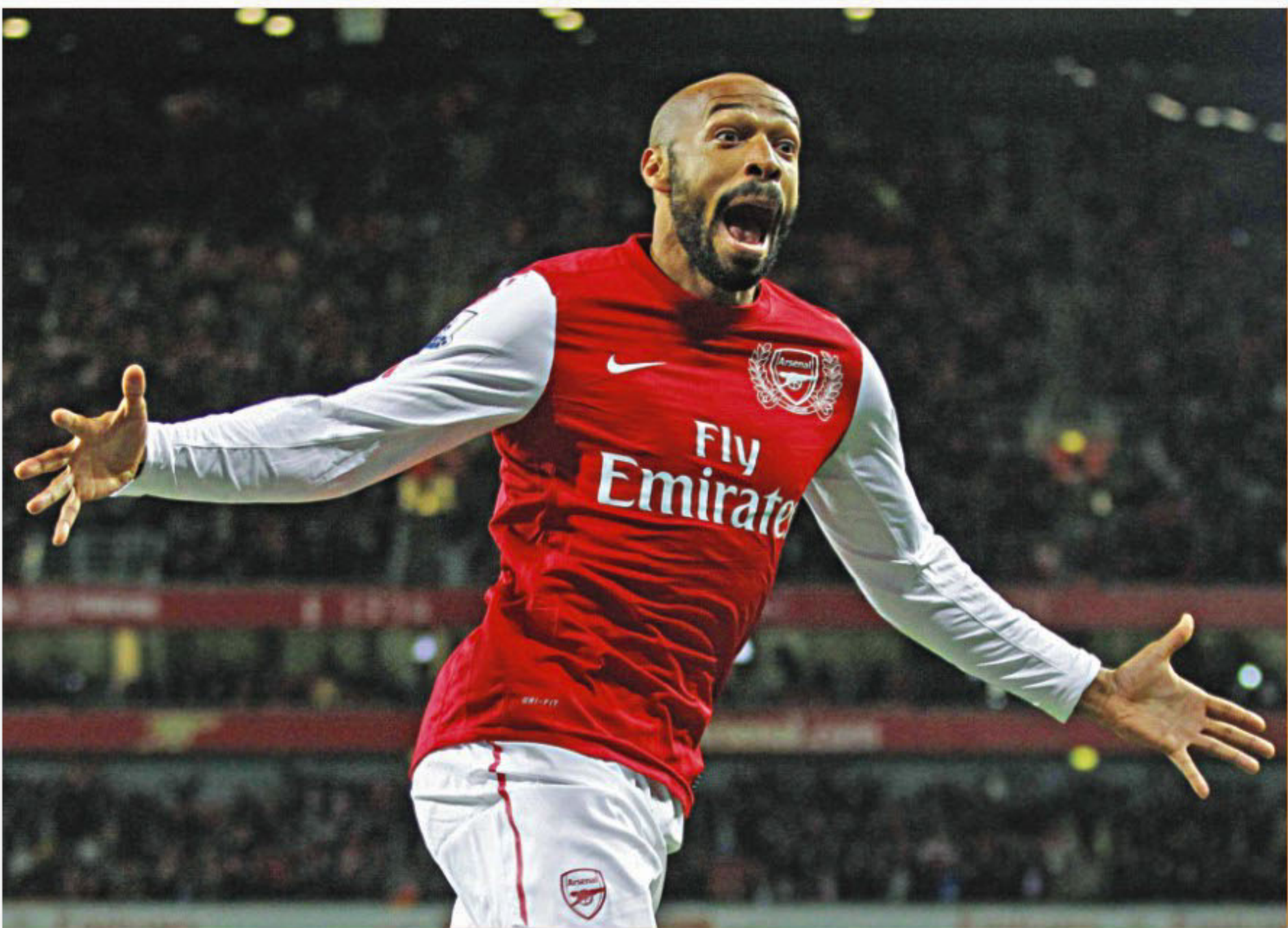
Arsenal legend Thierry Henry is ecstatic after scoring the all-important goal against Leeds United during their FA Cup encounter at the Emirates Stadium on Monday.