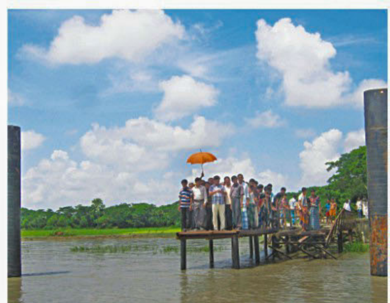
In absence of pontoon, passengers wait for launch at the makeshift jetty at Hajirhat launch terminal in Dashmina upazila under Patuakhali district, right, Uttar Dharandi launch terminal has been lying unused since it was lifted onto the ground during a cyclone a couple of years ago.