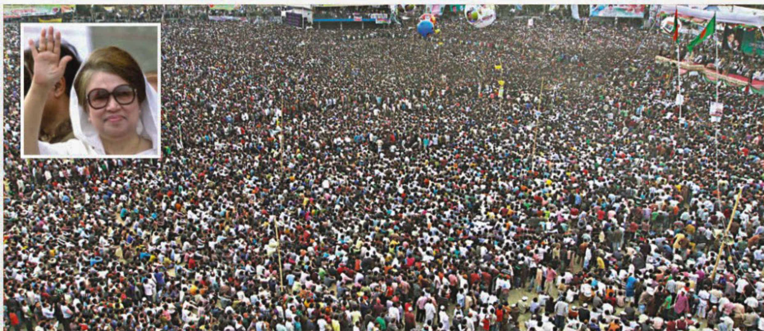
A vast crowd at the opposition rally in Chittagong yesterday. Inset, Khaleda Zia waves to supporters and activists.

Khaleda asks govt at Ctg public meeting after road march; announces 'grand rally' in Dhaka March 12