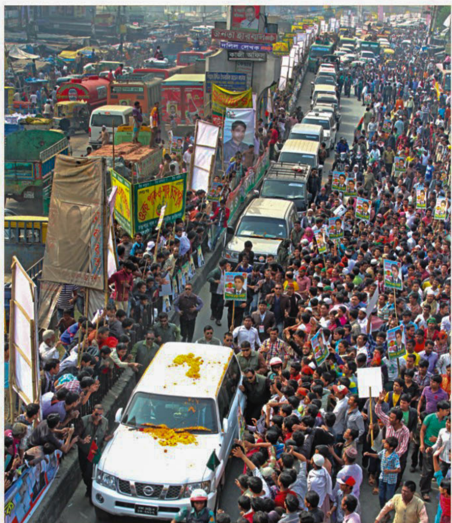
In a massive convoy of vehicles, BNP chief Khaleda Zia, in the first white SUV, leads the road march towards Chittagong yesterday. The photo was taken near Kanchpur Bridge on Dhaka-Chittagong highway. More photos on page 2, 5 & 20.

BNP takes road march to Ctg More than 3,000 vehicles join convoy; Khaleda reiterates demand for caretaker govt RAKIB HASNET SUMAN, from Feni