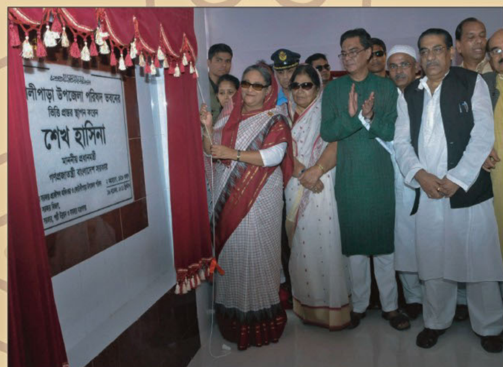
Prime Minister Sheikh Hasina laid the foundation stone of Kotalipara Upazila Parishad Complex Bhaban on 16 November 2011.