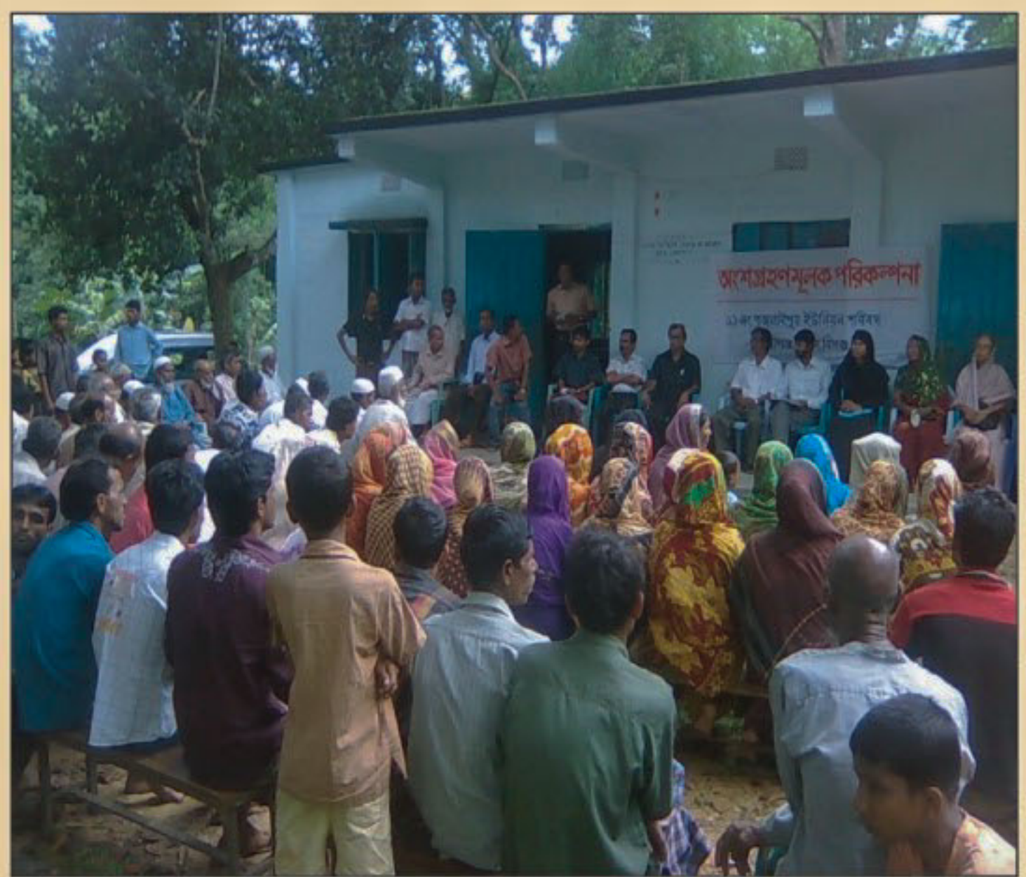
Participatory Planning at Union Parishad Level