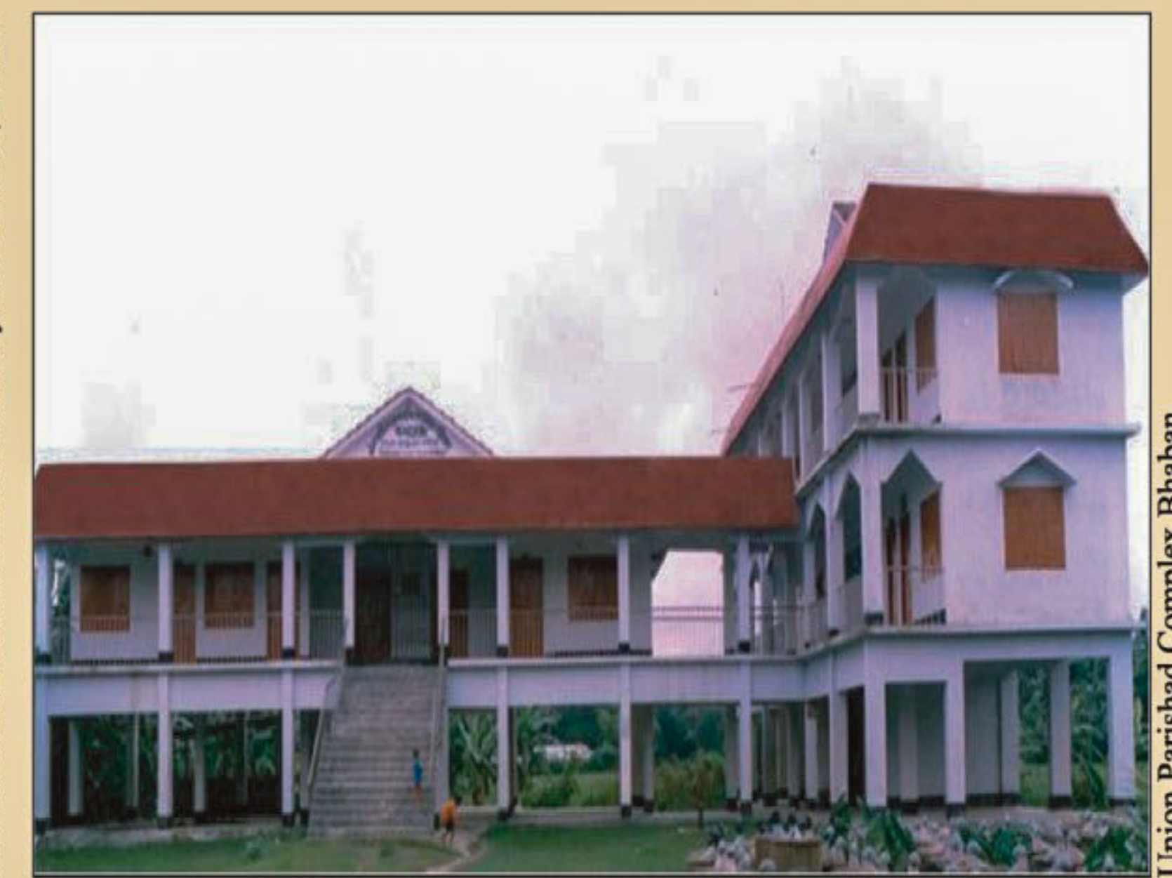
Union Parishad Complex Bhaban.