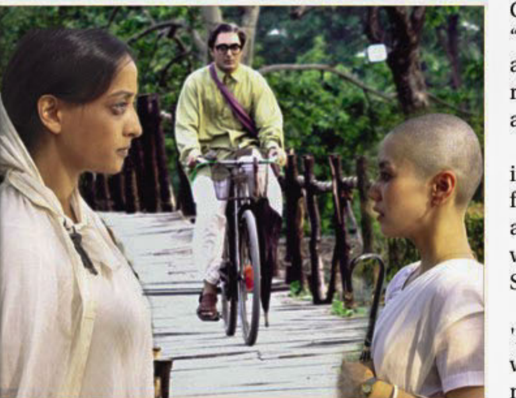
Scenes from "The Japanese Wife" and "Autograph" (top).