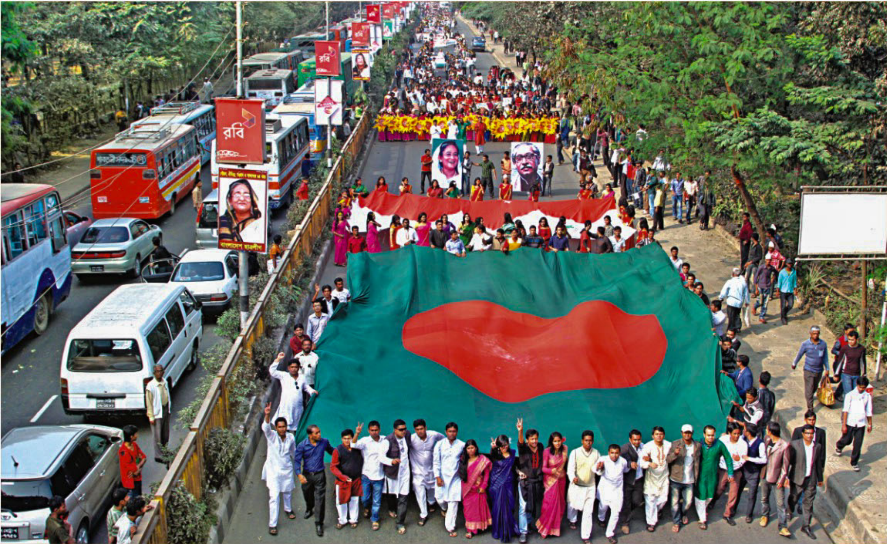
On the occasion of Bangladesh Chhatra League's 64th founding anniversary the ruling Awami League-backed student organisation brings out a celebratory procession in the capital yesterday, causing a traffic jam on a major thoroughfare of the city near Ramna Park.

energy-efficient generating plants and greater use of renewable power sources, said the Manila-based ADB in a statement. According to Power Development Board sources, aging thermal plants, inadequate natural gas supplies and lack of diverse power sources left the country with a gap of estimated over 1,200 megawatts in 2011 between electricity supply and demand. Still only 50 percent of people in Bangladesh have access to electricity, PDB sources added. ADB said frequent power shortage and SEE PAGE 19 COL 8