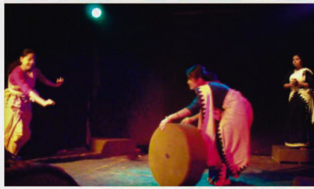
The play is in Bishnupriya Manipuri language.