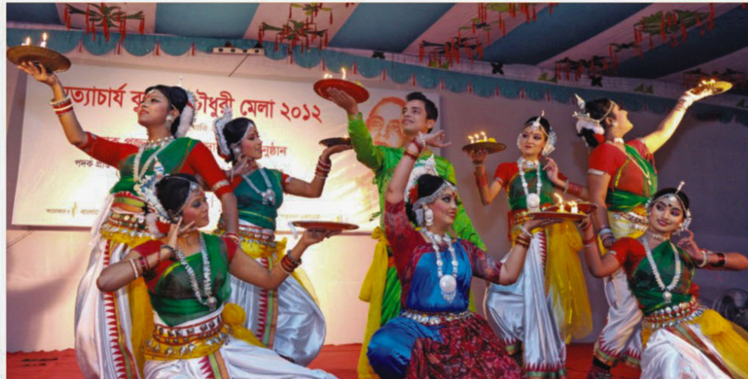
A group dance recital at the festival.