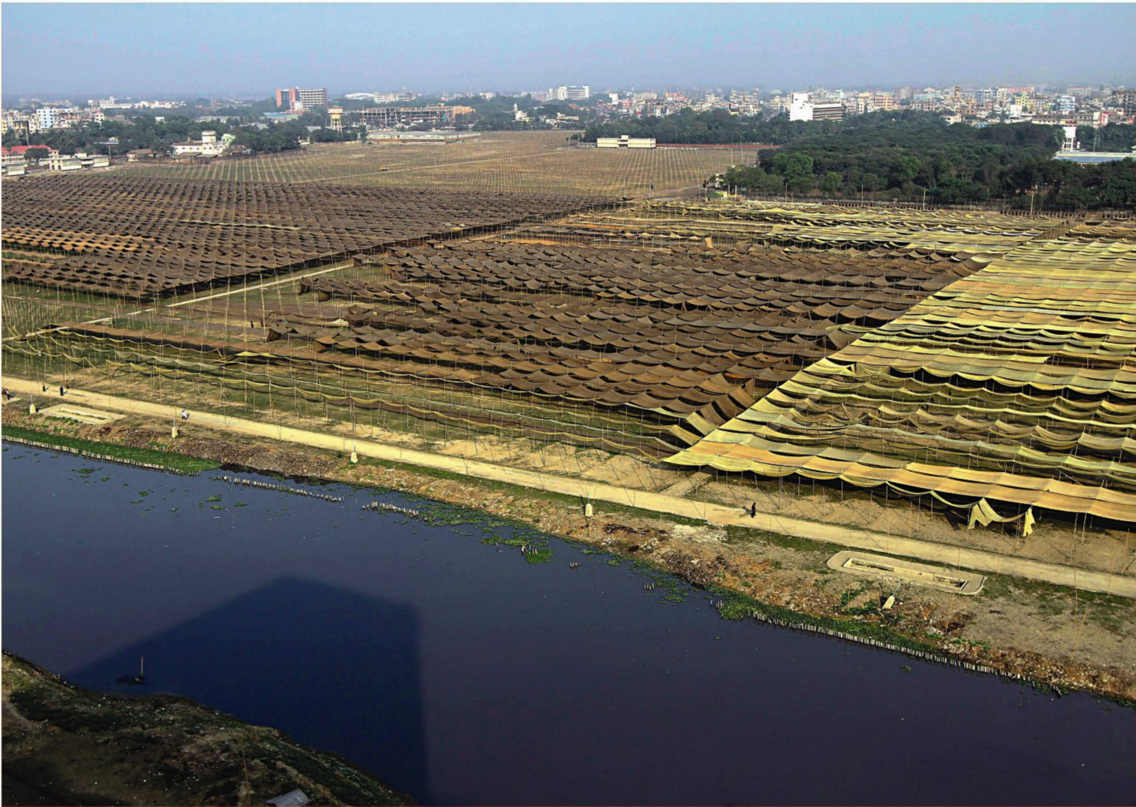
Tents are being pitched on the bank of Turag for the participants in the first phase of Biswa Ijtema to be started on January 13.