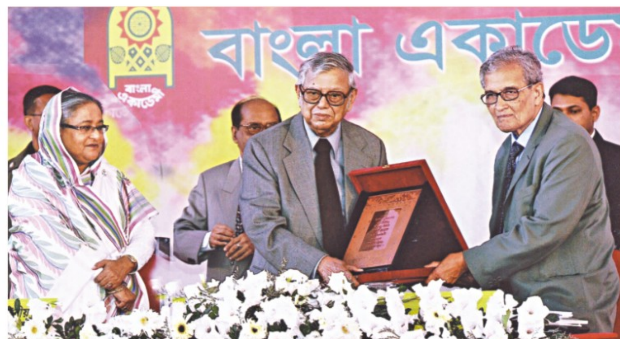
Nobel Laureate Economist Amartya Sen receives an honorary fellowship from Bangla Academy on the academy premises in the city yesterday. Prime Minister Sheikh Hasina was present on the occasion. (Story on Page 20)

To enter DU campus Old High Court, DMCH and Nilkhet road crossings should be used. All other crossings will be kept closed from 7:00pm (today) to 5:00am, it said.