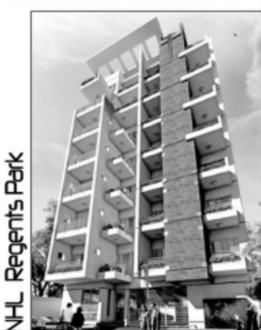
Size : 1200-2400 sft. Adjacent to Park & Mosque