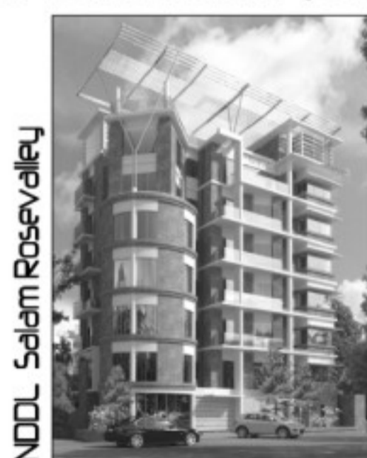
Size : 2500 sft. Corner Plot