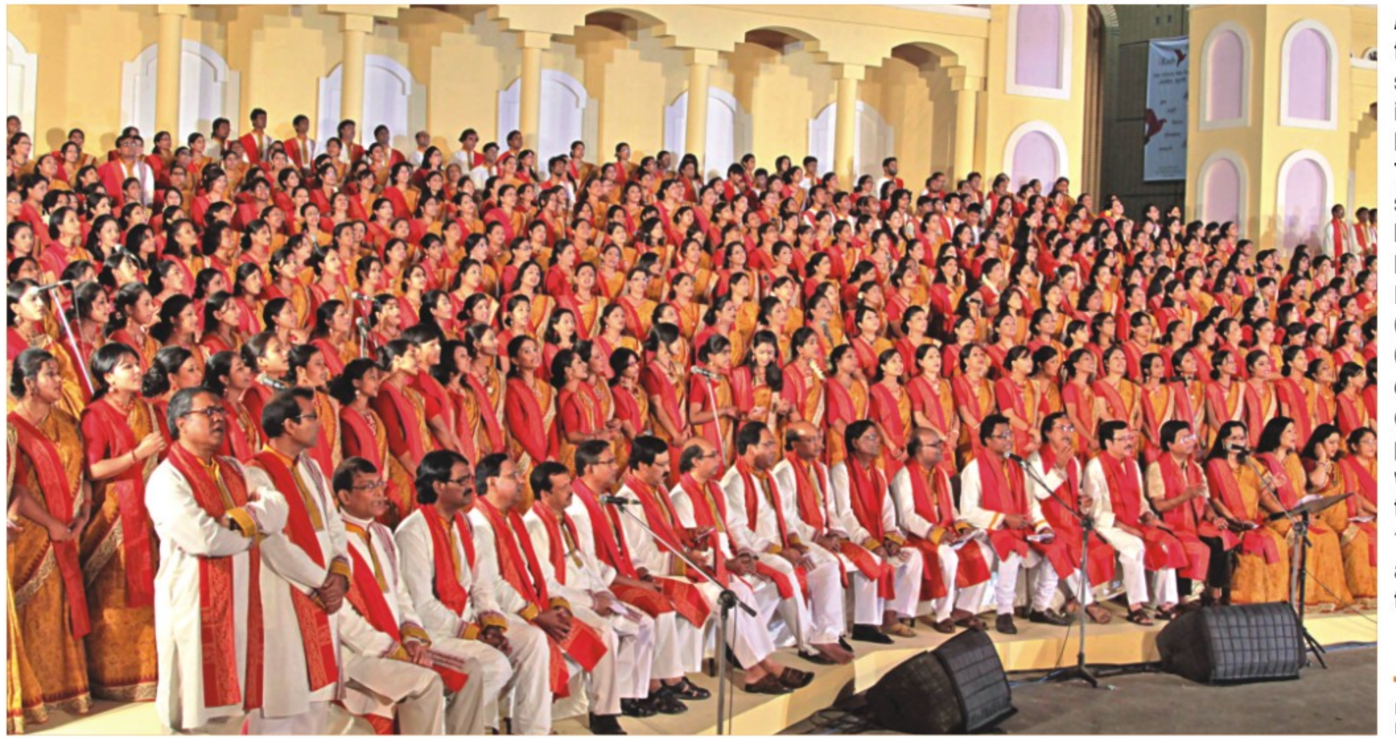
A section of the 1,000 singers singing a song of Rabindranath Tagore on a single stage built in front of Bangabandhu International Conference Centre in the capital yesterday. The programme was organised to mark the 150th birth anniversary of the poet.