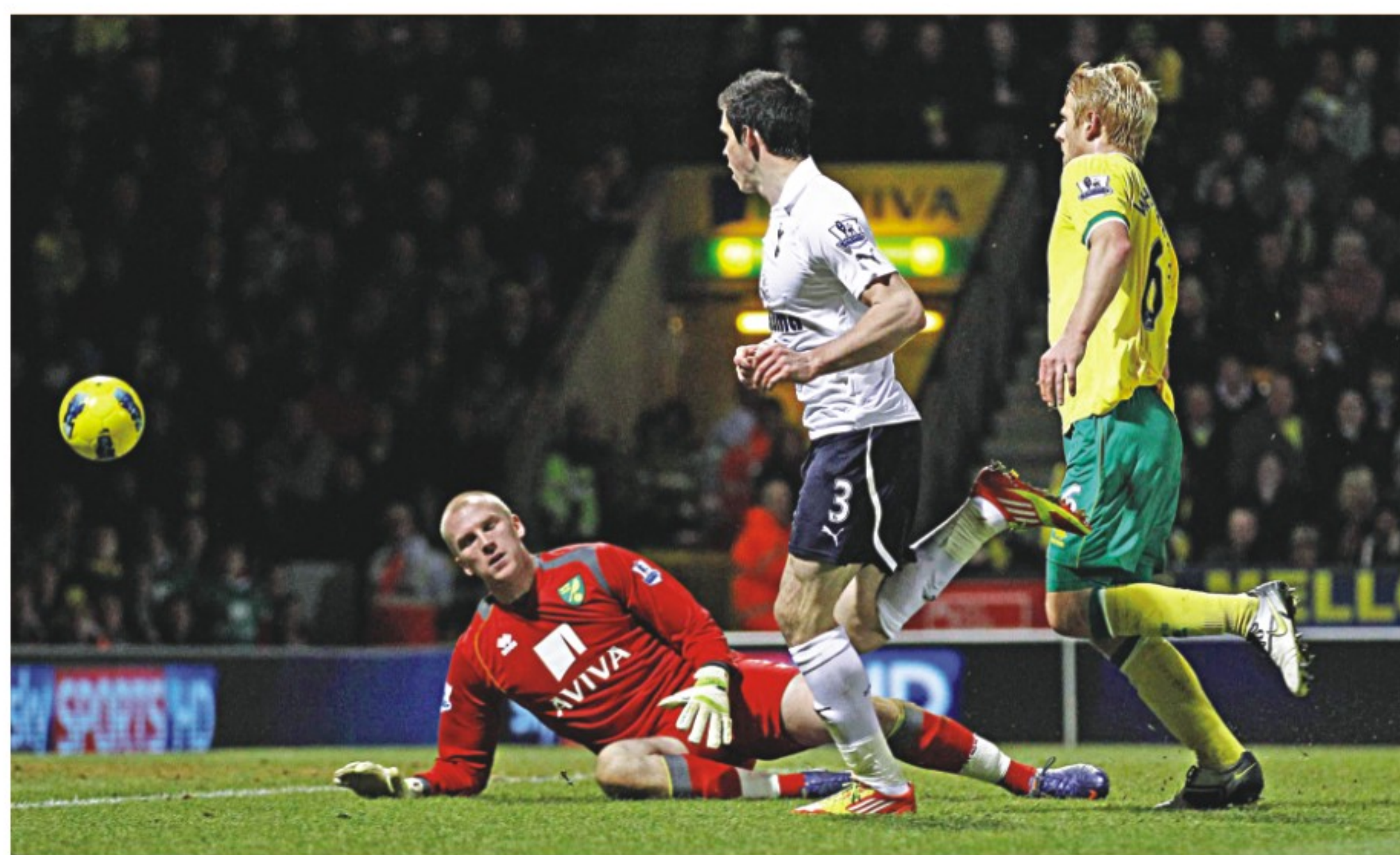
Tottenham Hotspur winger Gareth Bale (C) scores his second goal past Norwich City goalkeeper John Ruddy during their Premier League encounter at Carrow Road on Tuesday.