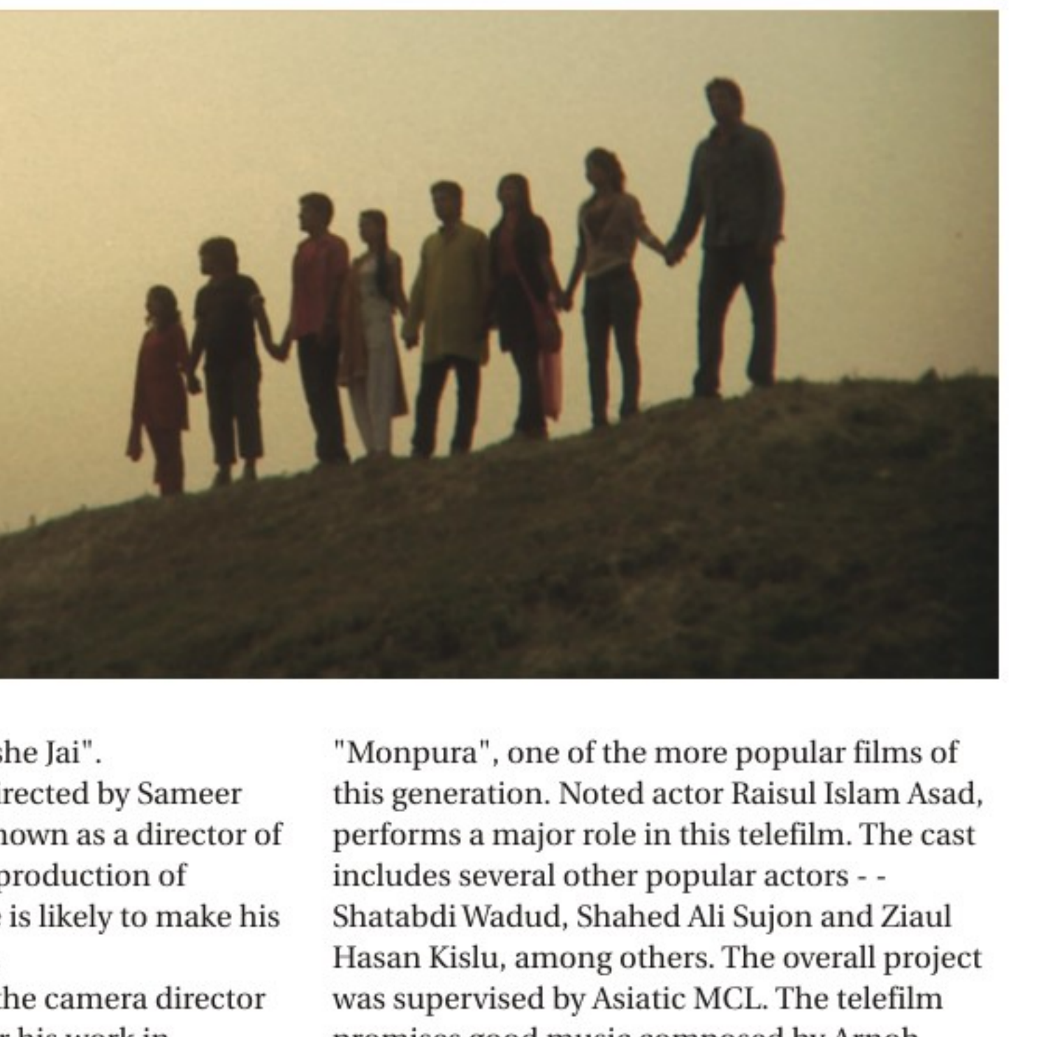
A scene from the telefilm.