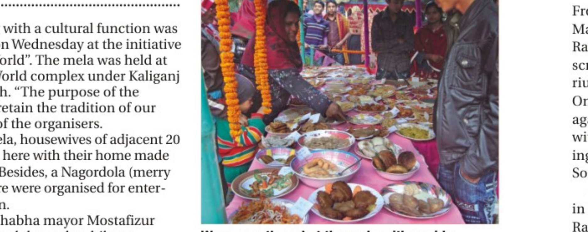
Women gathered at the mela with a wide variety of home made pitha.