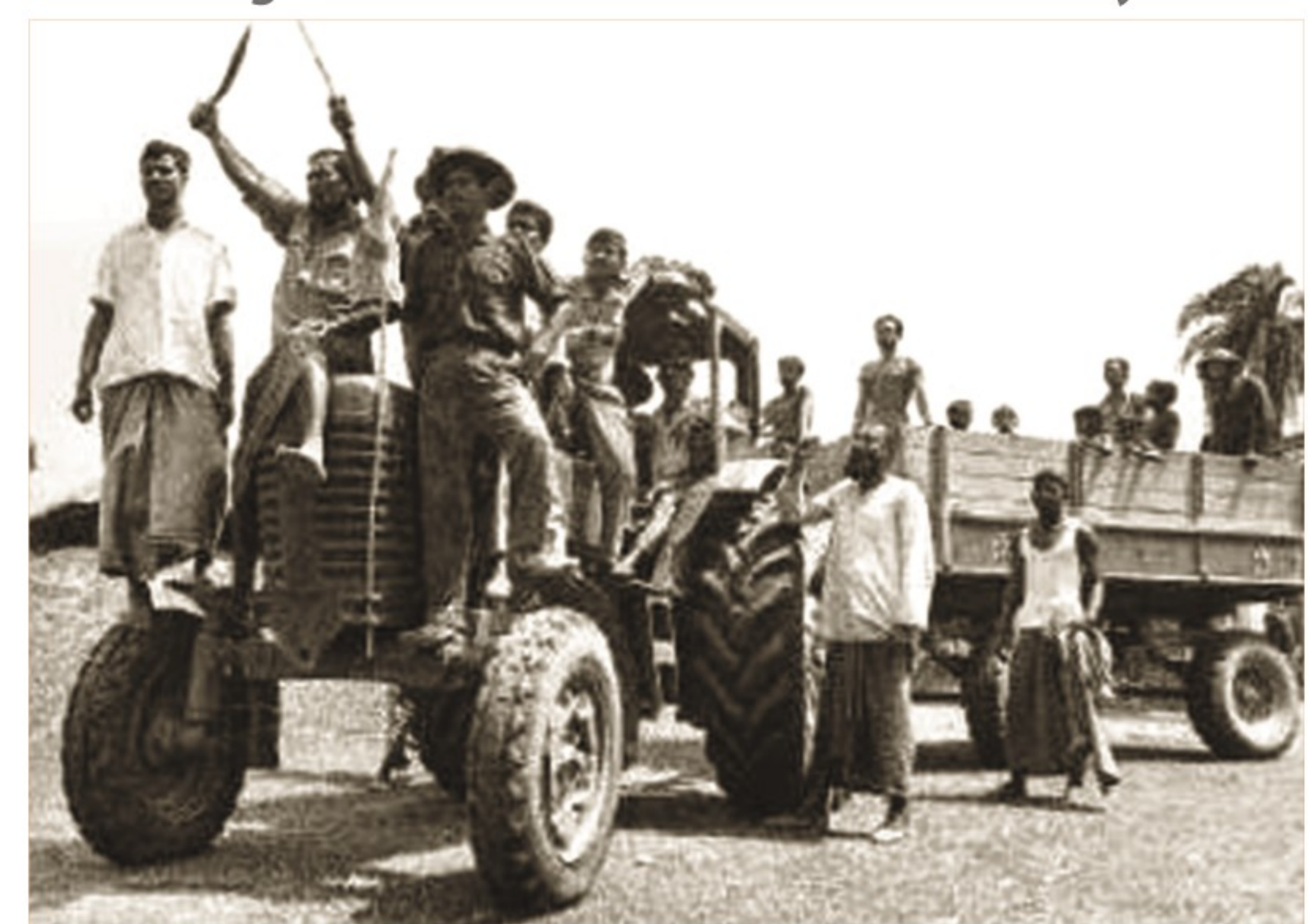
The documentary is to be treated as a visual archive of the War of Liberation.