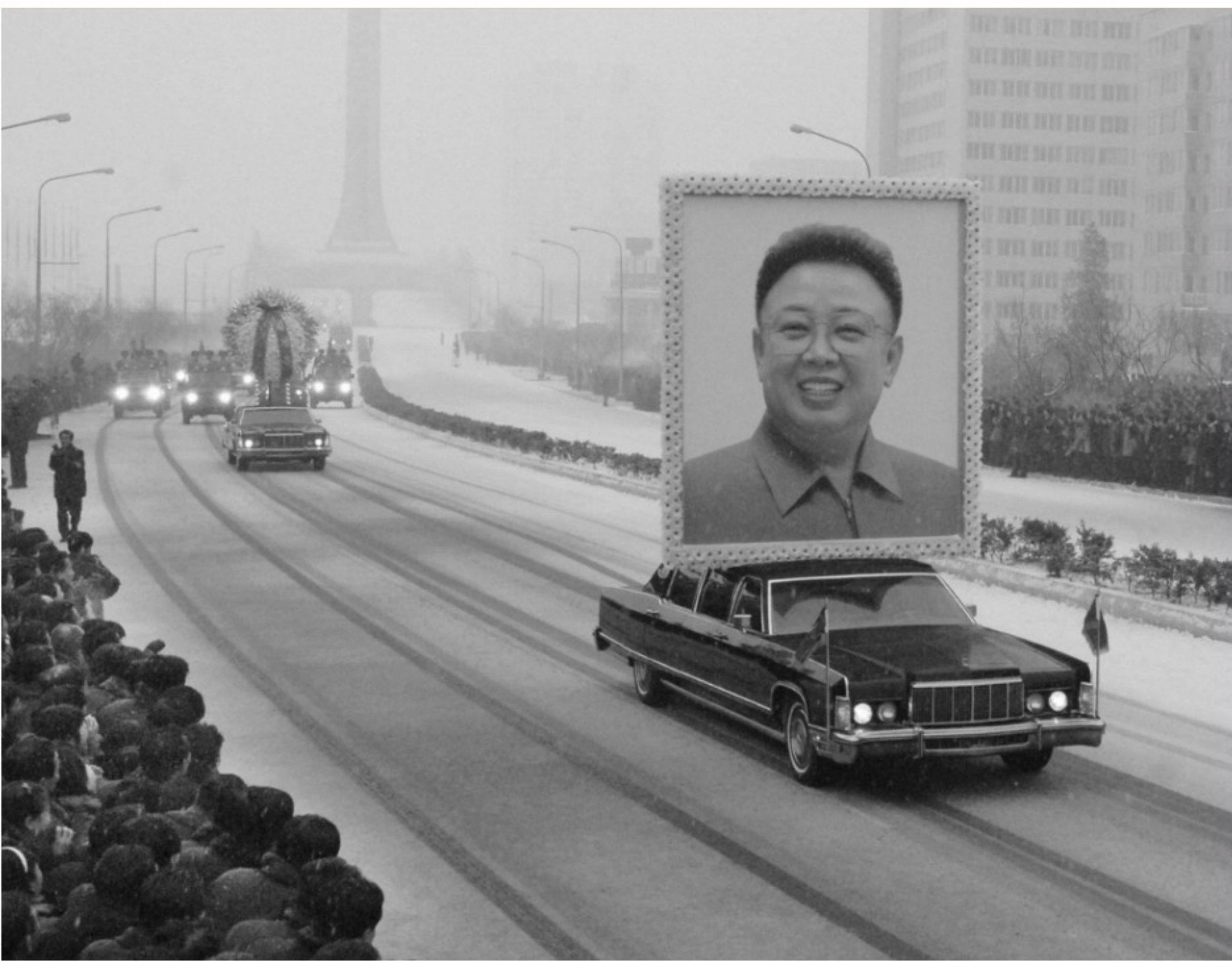
In this photo taken yesterday, a car carries a portrait of Kim Jong-il during the funeral procession in Pyongyang. Millions of grief-stricken people turned out to mourn Kim Jong-il, whose death has left the world scrambling for details about his young successor.