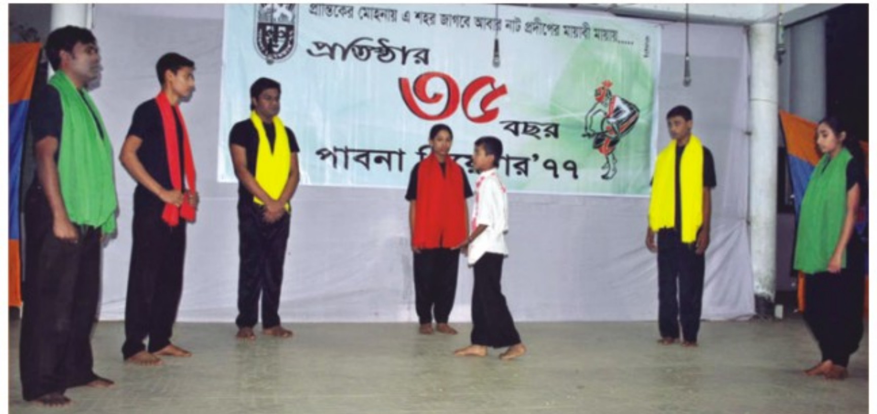
Different organisations staged six plays at the festival.