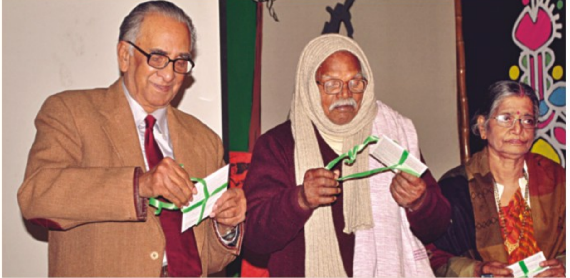
The CD comprises the works and lives of 48 eminent personalities.