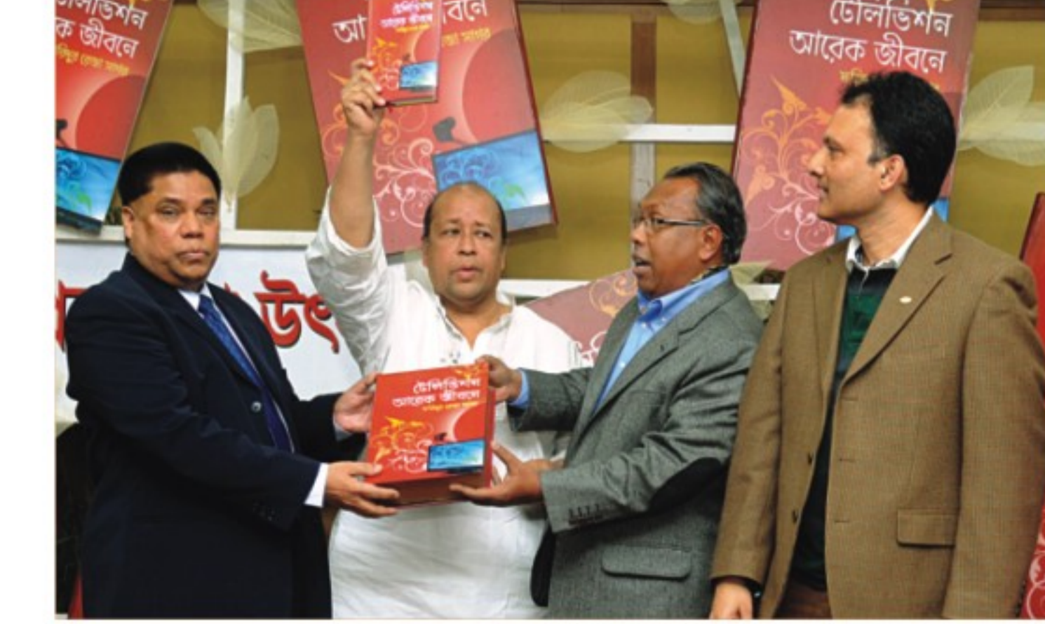
The book highlights the contributions of the electronic media in the country.