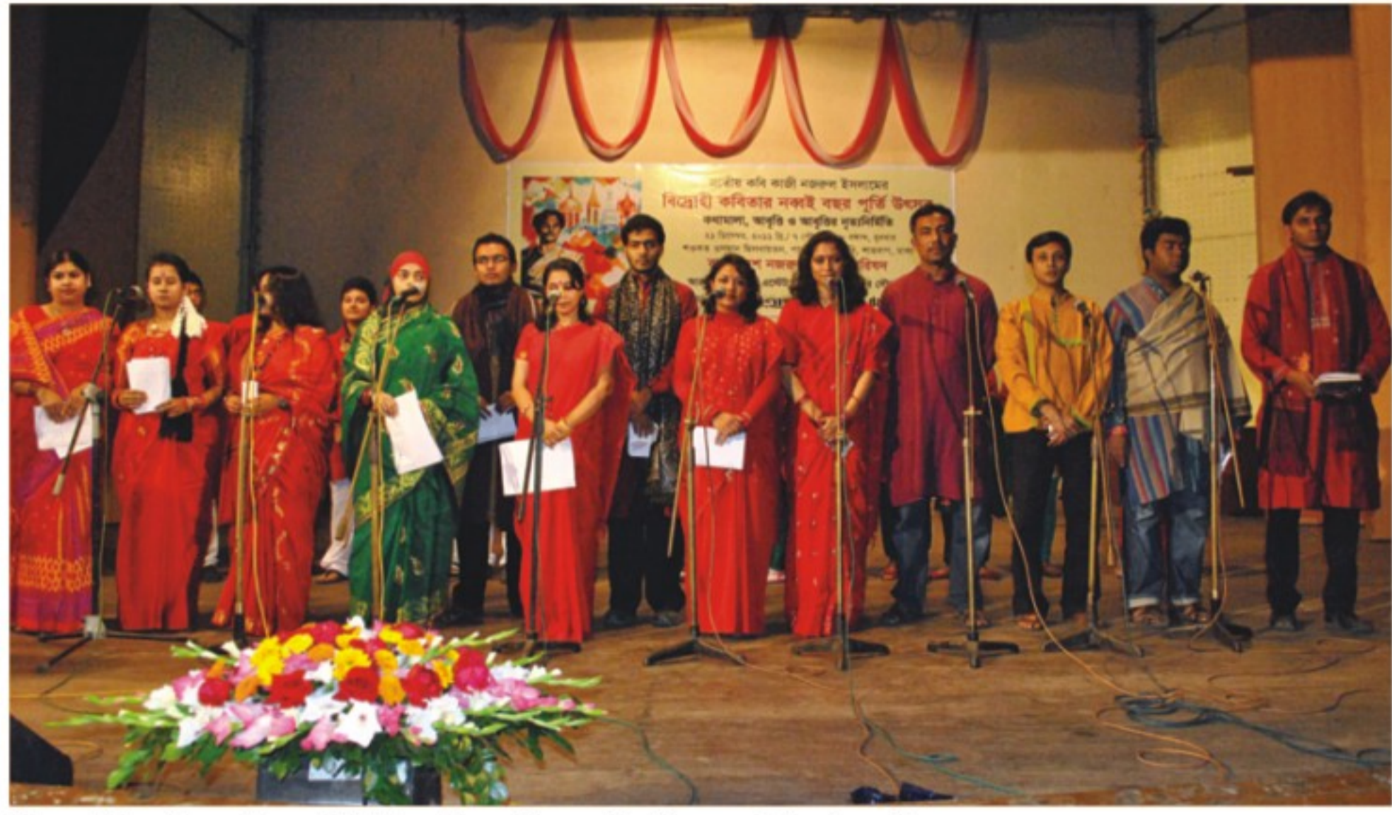
The celebration aims at taking Nazrul's poetry to people's doorsteps.