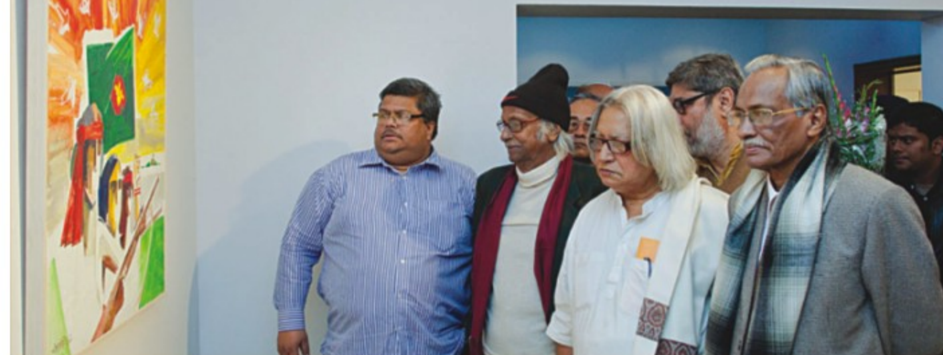
Dignitaries at the inaugural session of the exhibition.