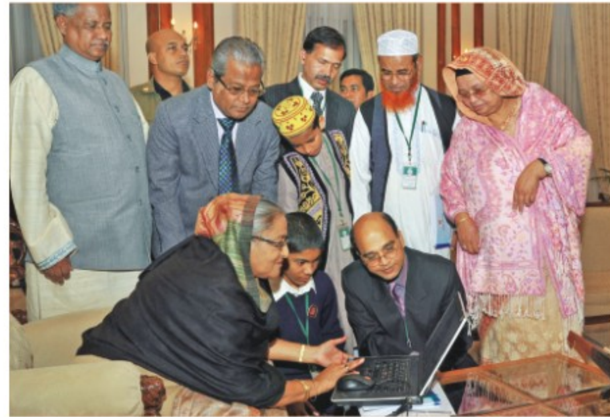
A girl, right, is very quick to announce her success to family the moment she gets to know she has achieved GPA-5 in the Primary Education Terminal Examination. (Clockwise from top) Jubilant students of Monipur High School, Dhaka; Dr Khastagir Girls' High School, Chittagong; Viqarunnissa Noon School and College, Dhaka; and Milestone Preparatory KG School, Dhaka. Prime Minister Sheikh Hasina, left, views the results on the internet at Gono Bhaban yesterday.