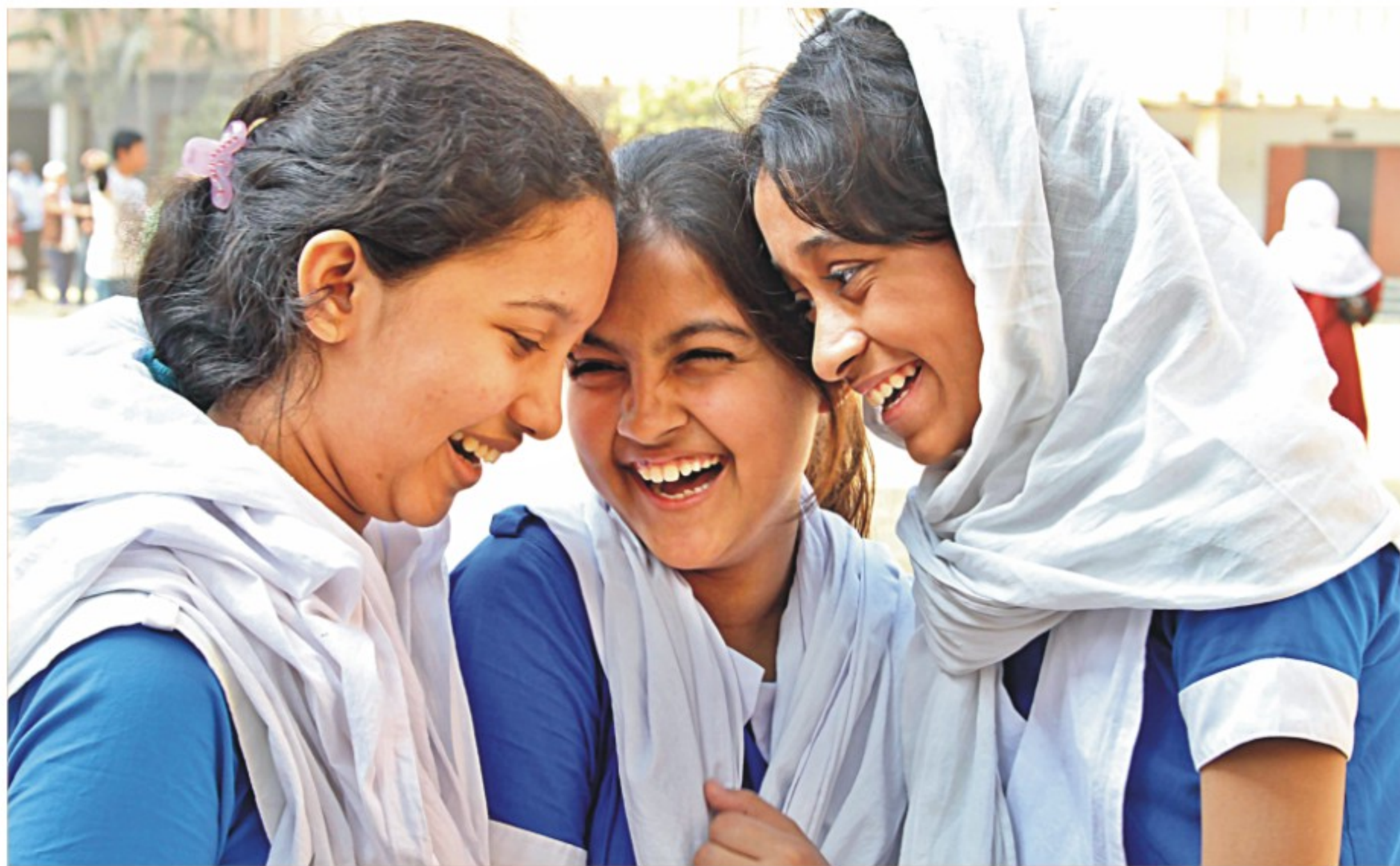
Elated students of Motijheel Ideal School and College that has won third place in this year's primary terminal exams. More photos on page 5.

STAFF CORRESPONDENT Monipur High School in the capital's Mirpur has emerged as the best school in the country in this year's primary terminal examinations. Seventeen among the top 20 schools are from Dhaka. The rest are from Comilla, Chittagong and Khulna which secured seventh, 14th and 18th positions. Monipur High School achieved cent percent pass rate in the examinations taken by Grade-V students. Seventy four per cent students of the