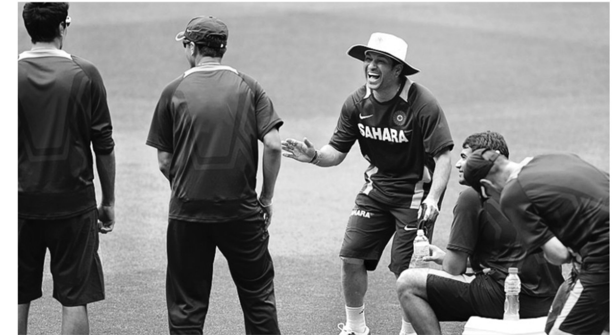
Sachin Tendulkar (3rd from R) shares a joke with teammates during a practice session at the Melbourne Cricket Ground yesterday, ahead of the first Test against Australia starting here today.