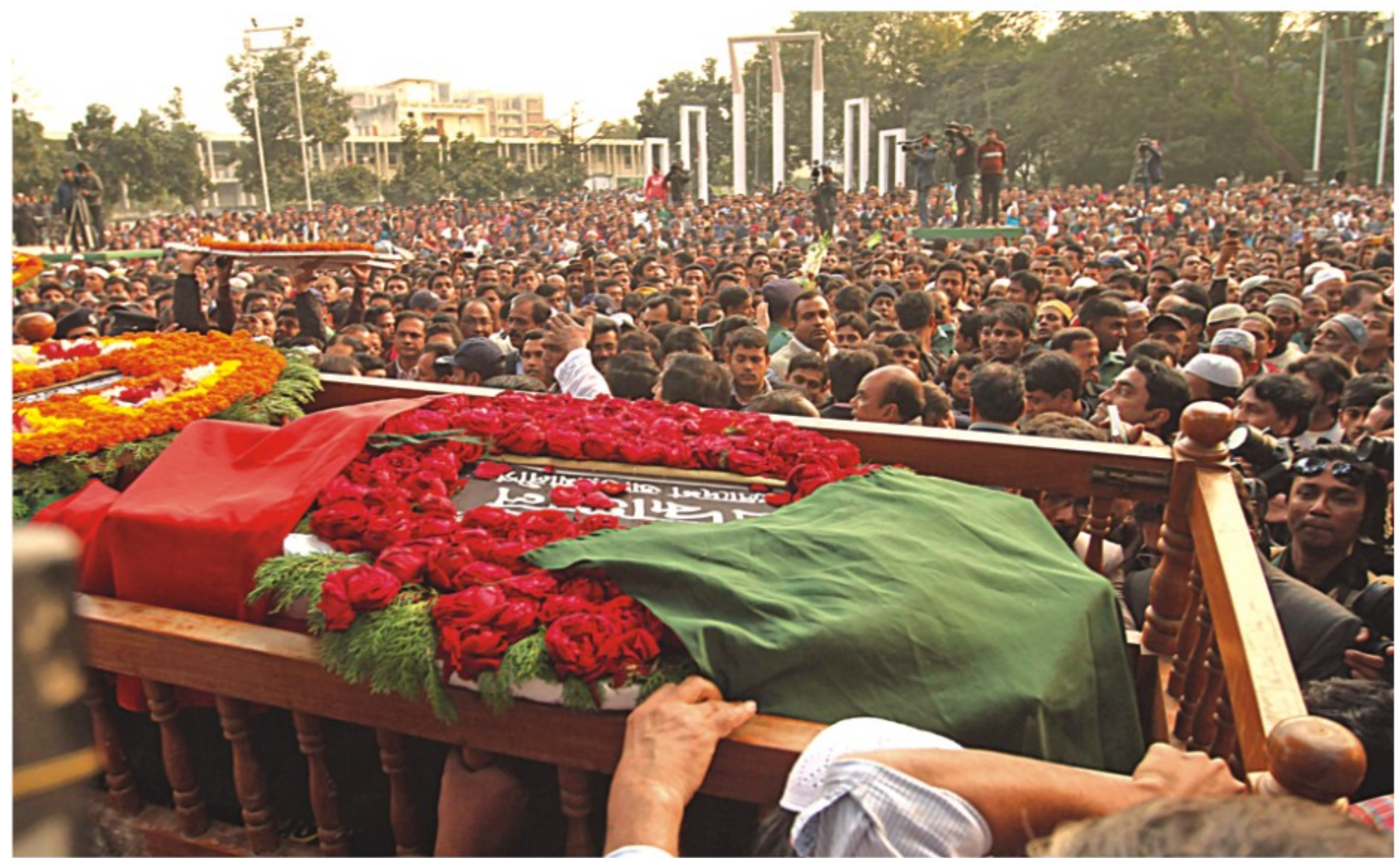
People from all walks of life throng the Central Shaheed Minar yesterday to pay their last tribute to Awami League veteran and Liberation War organiser Abdur Razzak.