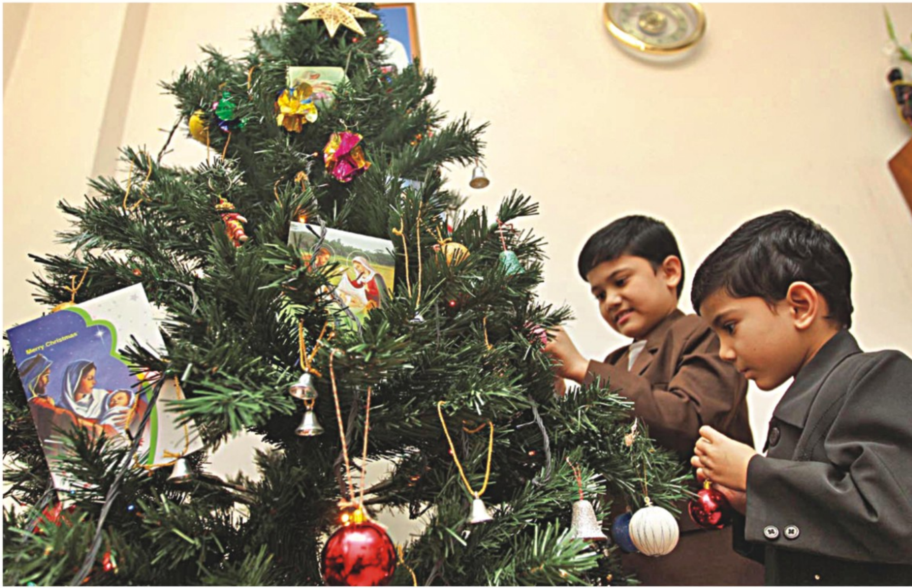
Children decorate a Christmas tree on Christmas Eve at their home in Patharghata of Chittagong yesterday.