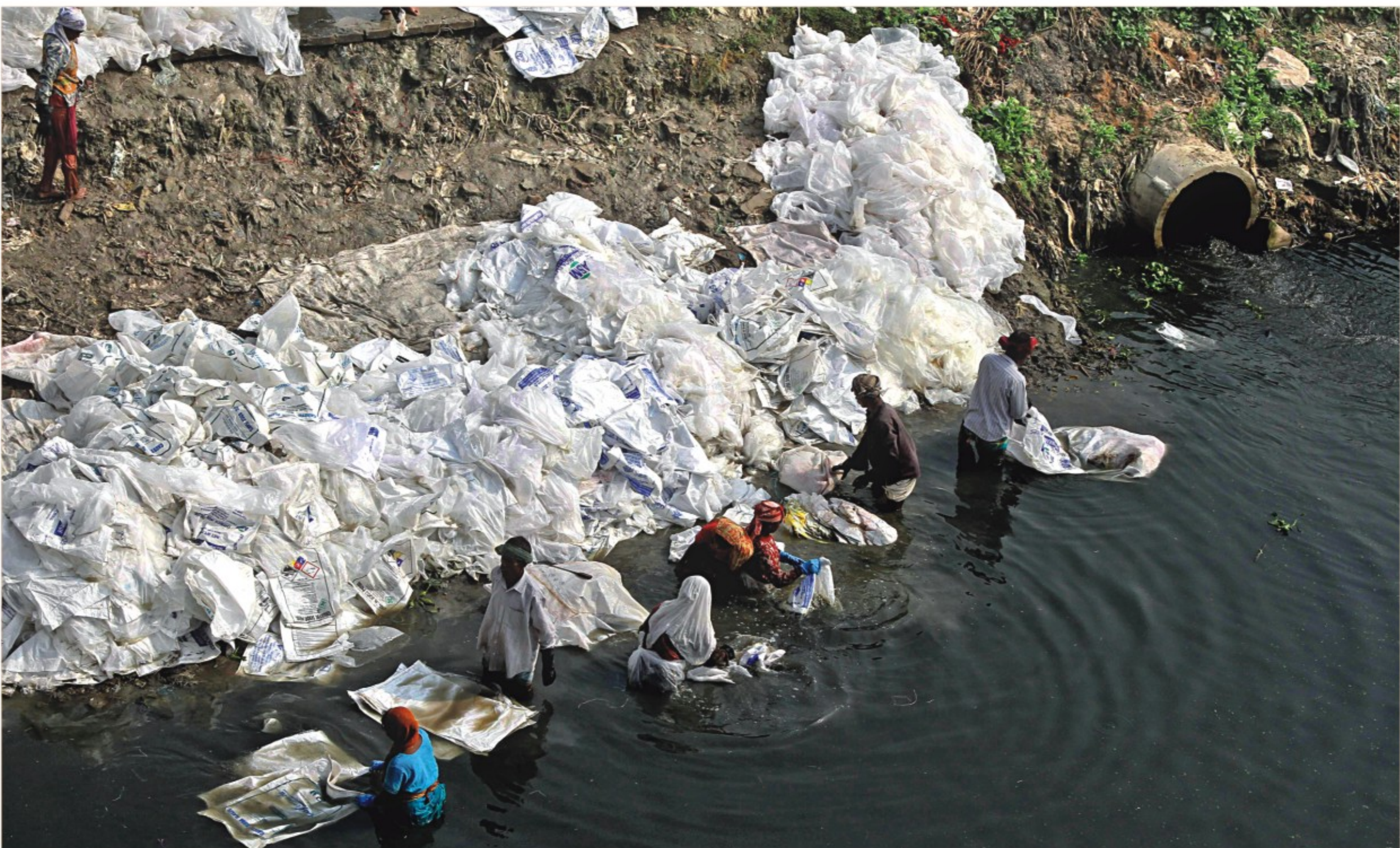
Sacks used to carry chemicals are being washed in the Turag, polluting the water of a major river in the country. The photo was taken from Kamarpara Bridge in Tongi a few days ago.